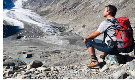
Times may be changed.