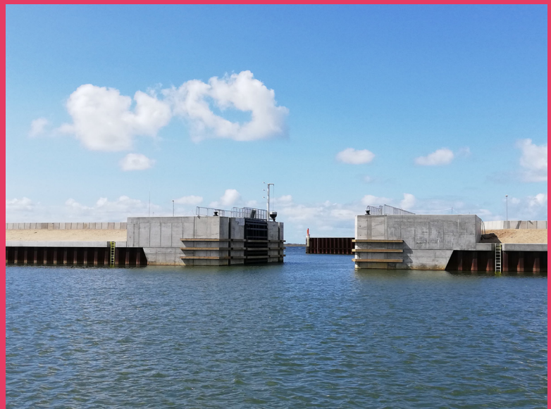
Figure 7. Example of a protection along a quay to the left (inner protection) and a barrier with a sluice gate in Esbjerg to the right (outer protection).