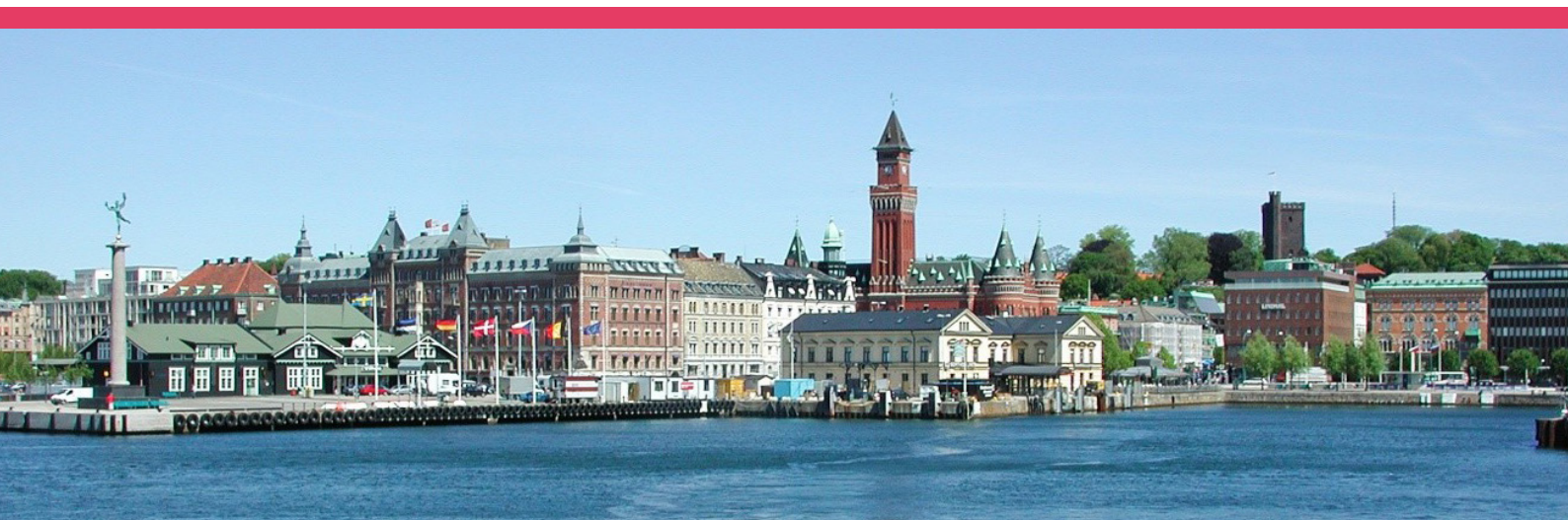
Figure 1. The inner docks of Helsingborg with the city centre on a low level. The old tower “Kärnan” in the background is in the upper part of the city.

railway tunnel, the busy alongshore main road, and the central station are at risk of inundation. This threat will increase with rising sea levels. As of today the city does not have a full scale flood protection or flood policy, but awareness amongst politicians, inhabitants and the municipality is increasing – which has led to the generation of this pilot report.