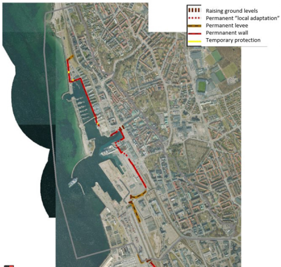
Figure 6. Proposal of inner protection including raising ground levels, permanent local adaptation, permanent levee, permanent wall and temporary protection.