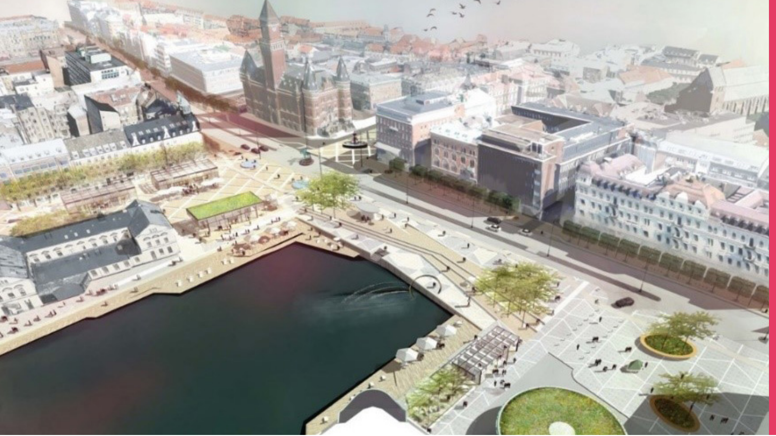
Figure 3. Visionary image of the inner harbor..