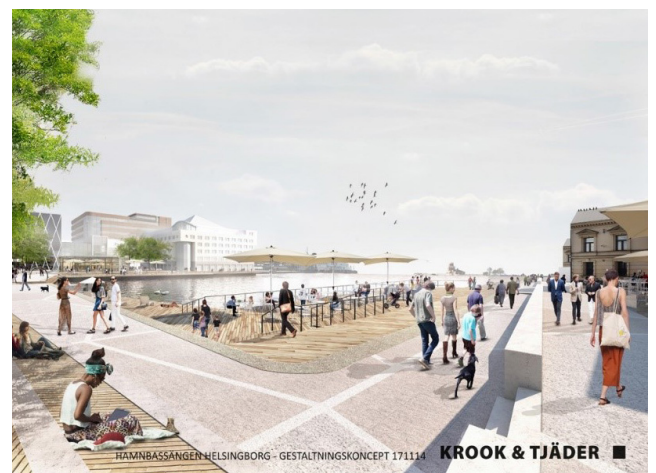
Figure 4. Visionary image of the inner harbor with example of inner protection.

The outcome of this pilot will be the ability to cost effectively protect the most important objects of public interest in the city. Communicating our strategy and the results achieved over the coming years can positively influence urban infrastructure planning and make climate adaptation a central part of all future developments.