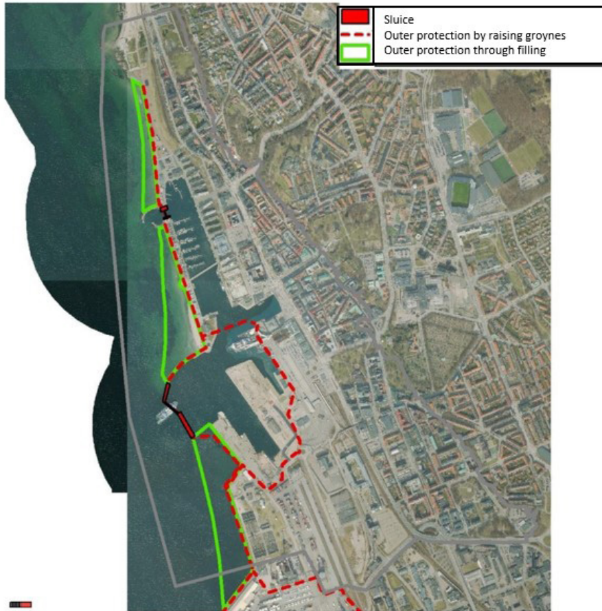
Figure 5. Proposal of outer protection including sluices, outer protection and reinforcement of existing groynes.