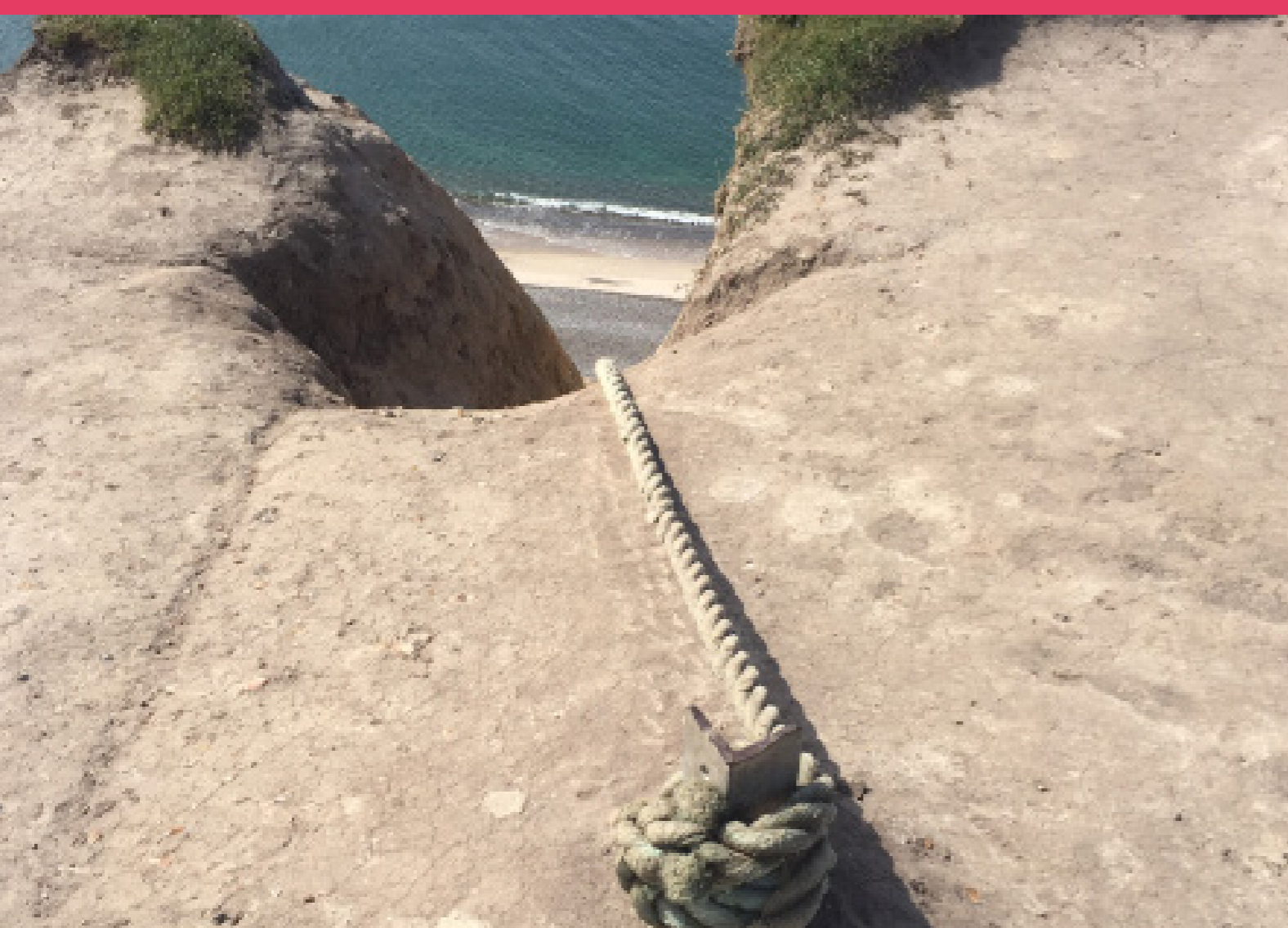
Coastal cliffs, Denmark

These complex decisions become even more difficult when the long-term choices (that take account of future uncertainties in climate and socio-economic context) clash with short-term political realities and varying perceptions of risk. In response, large-scale infrastructure investments, renewals or upgrades are often preferred over maintenance and monitoring. This 'bias-to-build' leads to solutions that may be unnecessarily costly or mal-adapted to the reality of the future as it emerges 12 .