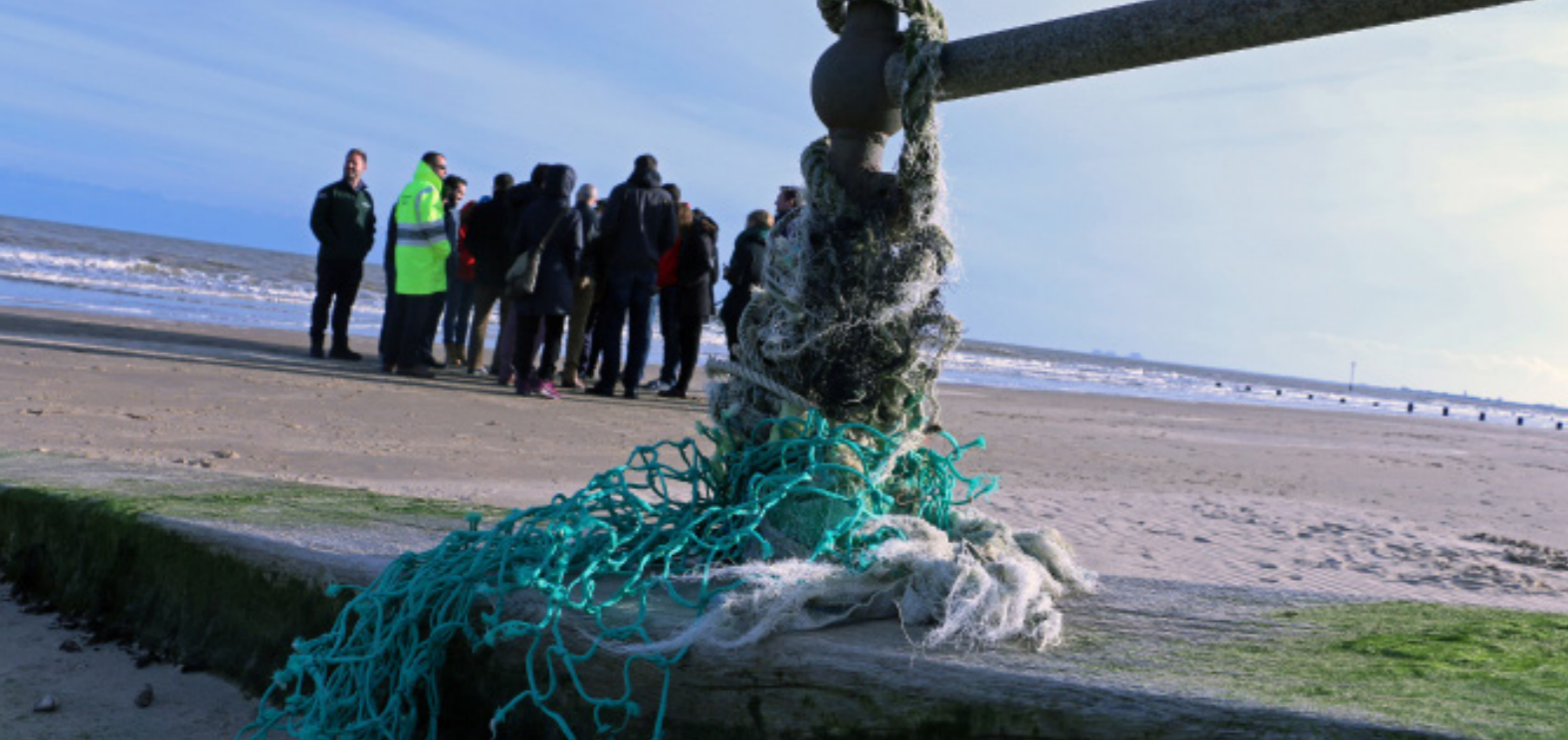
South coast, England