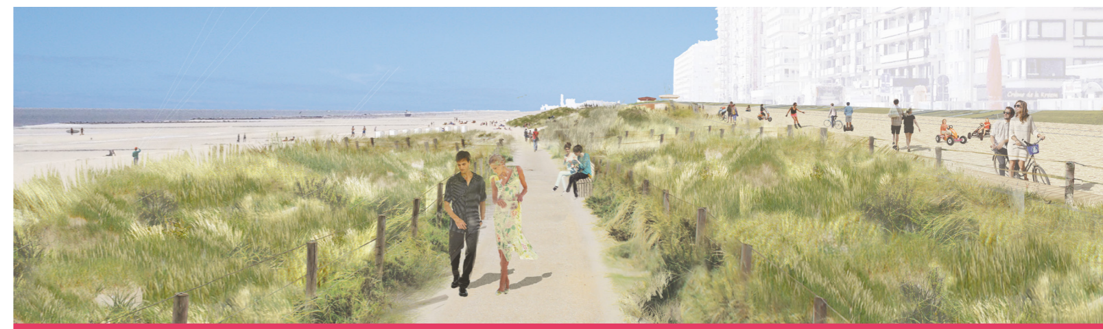
Belgium coast redevelopment

In Middelkerke an existing dike wall is being augmented with a dune system to provide a natural habitat and enhanced recreational opportunities. The dune also provides a natural adaptive capacity and can be widened or heightened to cope with sea level rise.