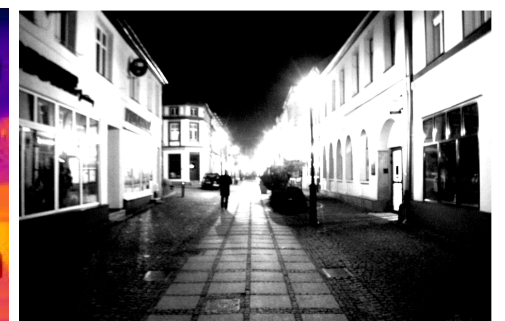
Overexposed facades in Połczyn-Zdrój