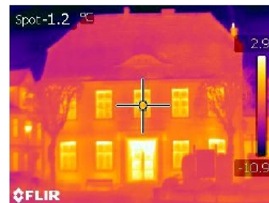
Thermograms of a buildings in Połczyn-Zdrój