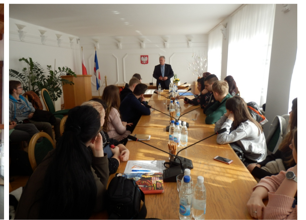
Meeting with students in Połczyn-Zdrój