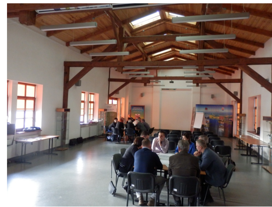
Meeting with stakeholders in Drawsko Pomorskie