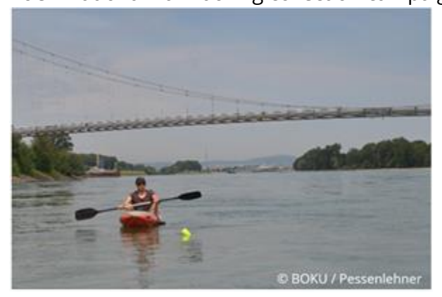
Accompanying the tracers

To track individual plastic parts, tests with GPS tracers were carried out on the Danube. For this purpose, different macroplastic parts that were frequently found in the Donau-Auen National Park during collection campaigns (e.g. PET bottles, PU foam, shoes, tennis