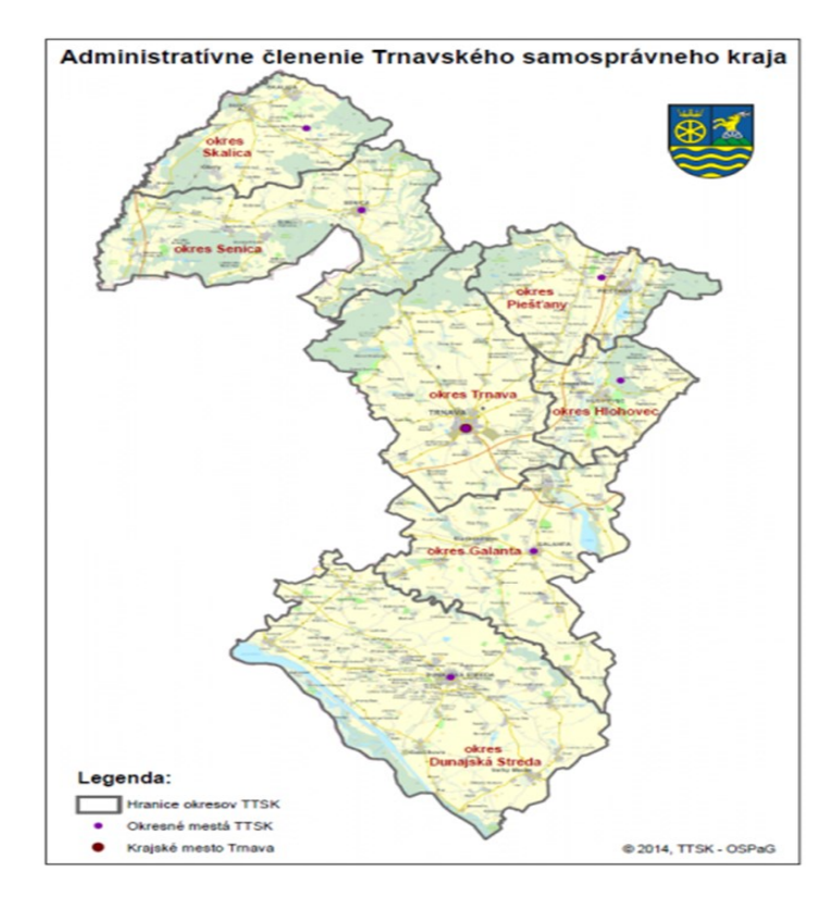
Figure 3: Map of the Trnava Autonomous Region<sup>7</sup>

It has an area of 4 174 km², with 559,000 inhabitants. The Trnava Self-Governing Region consists of seven districts and with a total area of 4 148 km², it constitutes 8.5% of the total area of the Slovak Republic. The number of 550,000 inhabitants is the smallest of all Slovak regions, but one of the most productive regions in industry and agriculture. In the county, there are 251 villages, of which 17 have the status of cities: Dunajska Streda, Gabčíkovo, Šamorín, VeľkýMeder, Galanta, Sereď, Sládkovičovo, Hlohovec, Leopoldov, Piešťany, Vrbové, Senica, Šaštín-Stráže, Skalica, Holíč, Gbely and Trnava, which is also the federal capital. The region is part of the Vienna - Bratislava - Győr - Mošon - Šopron development region. On the territory of the region, the engineering and food industries prevailed in the past. At present its structure is varied. The energy needed for industry is supplied by the Nuclear Power Plant in Jaslovské Bohunice and the Hydro Power Plant in Gabčík, which are of national importance. Industry is dominated by the production of passenger cars. The Trnava self-governing region belongs among the most productive agricultural regions of Slovakia. The total area of agricultural land in 2015 was 288,396 ha, which represents 69.5% of the total area of the region. Of the total agricultural land area, almost 90% (89.7%) constitute of arable land (258 775 ha).6