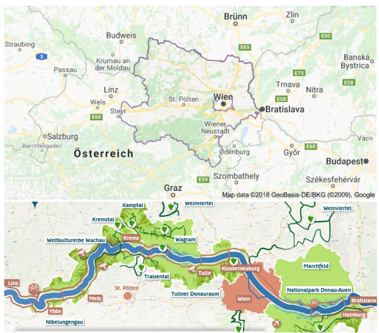
Figure 2: a) Map of province Lower Austria; b) the Danube river in Lower Austria

The province Lower Austria (Niederösterreich) has the largest area and the second largest population (after Vienna) of the nine federal provinces in Austria. It has a total area of 19,186 km², a population of 1,653,419 people (in 2016) and population density of 86 people per km². It is bordered to the north by the Czech Republic and to the east by Slovakia, where the river system of Thaya and March marks the frontier line. In the south, the foothills of the Eastern Alps form a natural boundary with the province Styria (Steiermark). In the south-east, Lower Austria borders the province Burgenland. Administratively, the state is divided into 20 districts (Bezirke), four independent towns and 573 municipalities.