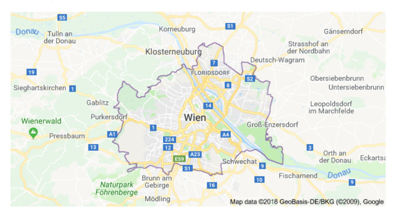
Figure 1: Map of the City of Vienna

Vienna (Wien) is the capital and largest city of Austria by area and population. It has a population of 1.8 million people, a population density of 4,326 people per square kilometre and a total area of 414.65 square kilometres. The city is the cultural, economic, and political centre of the country, accounting for 35% of the national population and 37% of GDP in 2016 (Euromonitor, 2017). Vienna is located in north-eastern Austria, at the easternmost extension of the Alps in the Vienna Basin and includes both sides of the Danube River. Since Vienna has a federal state status, the city council is also the state parliament, and the mayor also holds the function of the state governor. Vienna is a highly touristic city with about 15 million visitors in 2016.