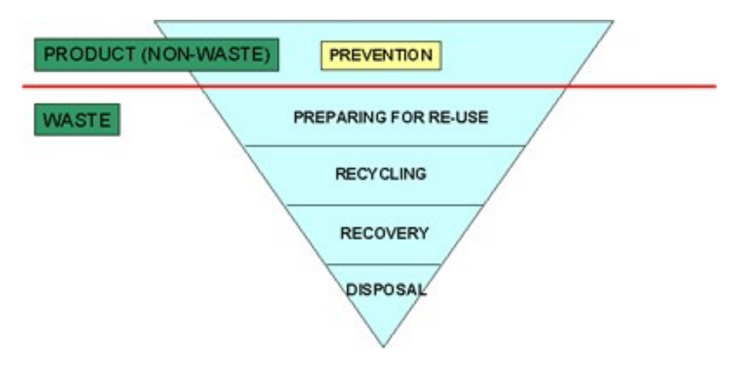
Figure 3: Waste hierarchy according to Waste Framework Directive

The Waste Framework Directive (WFD; Directive 2008/98/EC) sets the overarching legislative framework including basic concepts and definitions related to waste management in the EU, such as definitions of waste, recycling and recovery. It explains when waste ceases to be waste and becomes a secondary raw material (so called end-of-waste criteria), and how to distinguish between waste and by-products. The WFD lays down some basic waste management principles: it requires that waste be managed without endangering human health and harming the environment, and in particular without risk to water, air, soil, plants or animals, without causing a nuisance through noise or odors, and without adversely affecting the countryside or places of special interest. Waste legislation and policy of the EU Member States shall apply as a priority order the following waste management hierarchy (Figure 3): Waste management strategies must aim primarily to prevent the generation of waste and to reduce its harmfulness. Where this is not possible, waste materials should be reused, recycled or recovered, or used as a source of energy. As a final resort, waste should be disposed of safely (e.g. by incineration or in landfill sites, European Commission 2008).