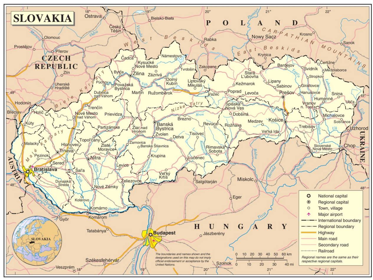
Figure 1: Map of Slovak Republic<sup>3</sup>