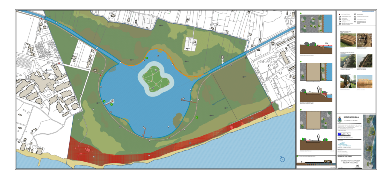
Figure 4: Table of the project called "EXECUTIVE DESIGN AND PERFORMANCE OF THE VALORISATION AND REQUALIFICATION OF INTEGRATED LANDSCAPES OF THE COASTAL LANDSCAPES OF UGENTO"

3. creation of artificial islets in order to create an ideal habitat for nesting and shelter for birdlife.