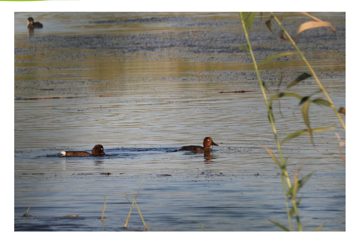
Figure 3: Ferruginous Duck in the basins of the Regional Natural Park "Litorale di Ugento" - 2019 monitoring campaign