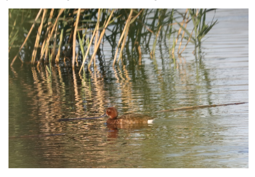
Figure 2: Ferruginous Duck in the basins of the Regional Natural Park "Litorale di Ugento" - 2019 monitoring campaign

The LASPEH project included among its concrete actions for the protection of the Moretta also the realization of a monitoring in order to provide useful and updated data on the presence of the species of interest. The activities carried out starting from July 2019 confirmed the presence of the duck with at least 6 potentially nesting pairs present in the Rottacapozza Nord and Rottacapozza Sud basins. These basins are characterized by less salt water and by a suitable vegetation for the Ferruginous duck.