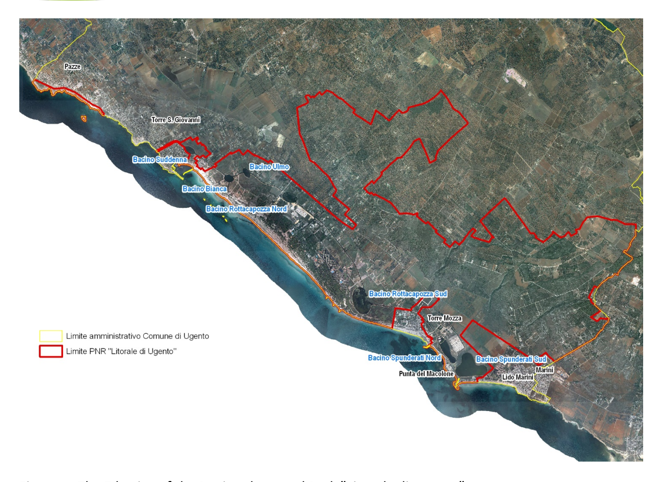
Figure 1: The 7 basins of the Regional Natural Park "Litorale di Ugento"

The halophilic vegetation that develops along the edge of the basins is characterized by formations of Spartina juncea and Juncus maritimus that form part of the Junco maritimi-Spartinetum junceae Biondi 1992 of the class Juncetalia maritimi Br.-Bl. 1952.