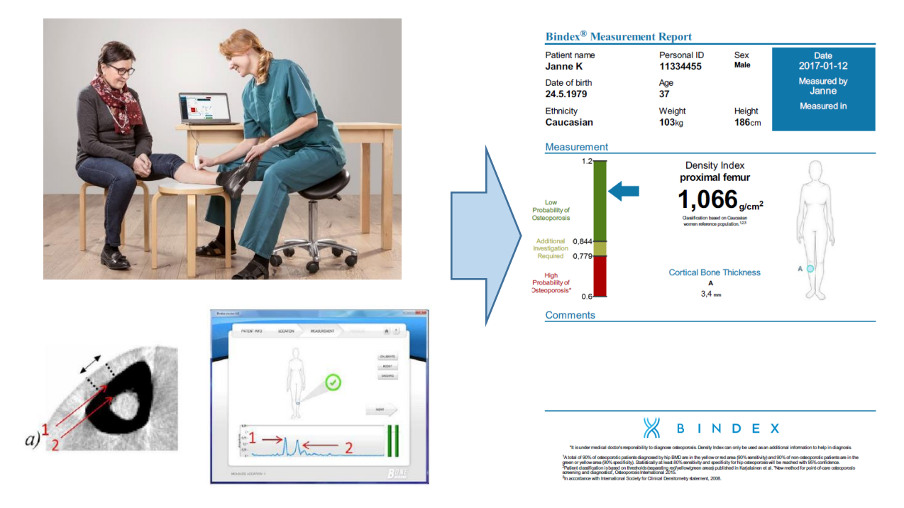
Figure 1: Ultrasound measurement (Bindex<sup>®</sup>) at proximal tibia. Tibial cortical thickness is measured, and a diagnostic parameter, Density Index, is calculated based on the cortical thickness and patient age, weight and height. Results sheet (on the right) shows the Density Index on a color scale, with classification with diagnostic thresholds as required by the International Society for Clinical Densitometry guidelines (ISCD).

conducted at 1/3 of the length of the tibia from the proximal head by trained study nurses (Figure 1). The device consists of a hand piece connected into the USB port of a laptop and an ultrasound probe. Two parameters were collected including cortical thickness at the proximal (Ct. Thprox) tibia and the DI. The method for cortical thickness measurement has been validated and can be considered as accurate method of osteoporosis assessment as comparing to axial DXA<sup>9</sup>.