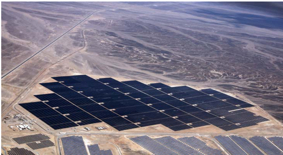
SHAMS MAAN, 52.5 MW, JORDAN