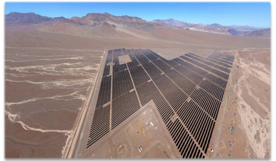
LUZ DEL NORTE, 147 MWp, CHILE