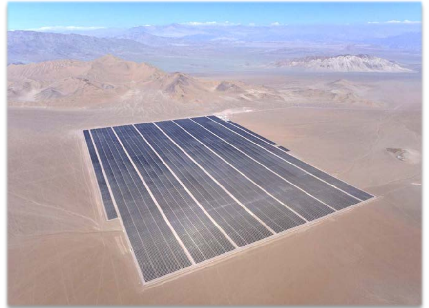
LLANO DE LLAMPOS SOLAR POWERPLANT, 100 MWp, CHILE