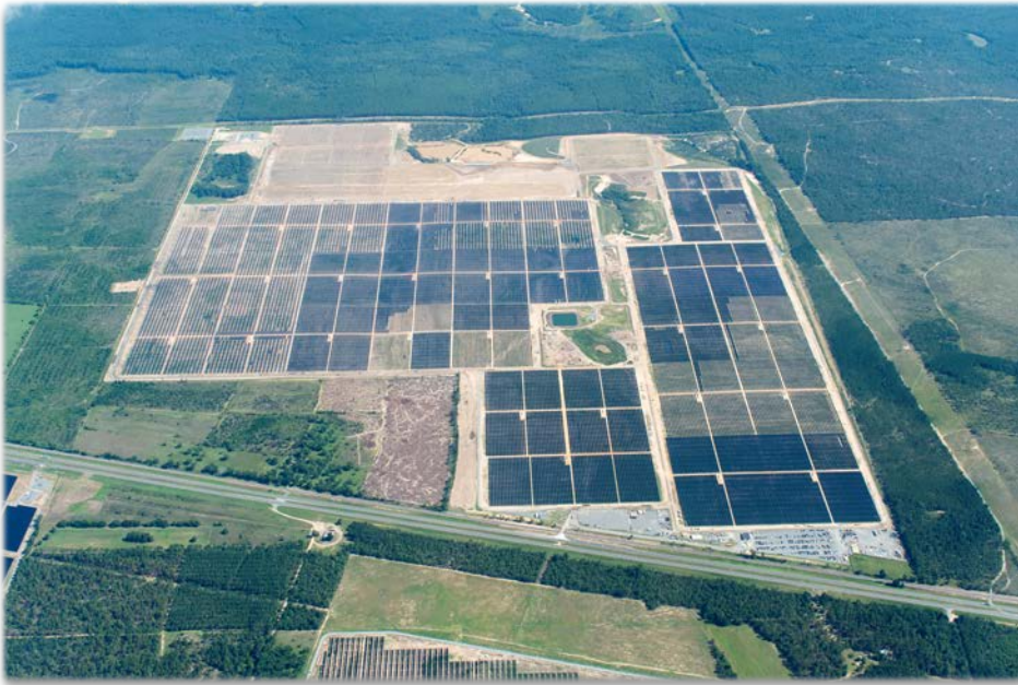
TAYLOR SOLAR POWERPLANTS, 330 MWp, USA