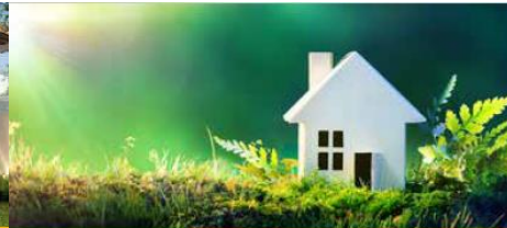
Equatum quodis apic te nam dunt, ope non non paratit pro quidit tam.

CIRCULAR BUSINESS FOCUS ON RAW MATERIALS IN SLOVENIA