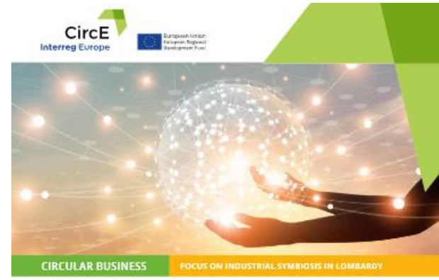
CIRCULAR BUSINESS FOCUS ON INDUSTRIAL SYMBIOSIS IN LOMBARDY

thinking and attitude towards goods, materials and resources. A radical change is called simply - circular economy.