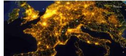
Luptat herte coaccae vidoria indelicet lupati qui rem as ulparante cone et ut officim volatit.