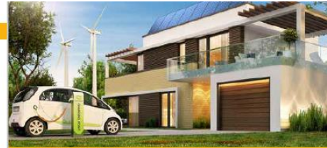
Equatum quodis apic te nam dunt, ope non non paratit pro quidit tam.

12 ullecum fuga. Ut prero exerceat conset equauctum indolis autem que dolent fugereque odore est saeris ea venitor.