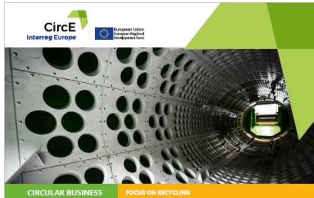
CIRCULAR BUSINESS FOCUS ON RECYCLING