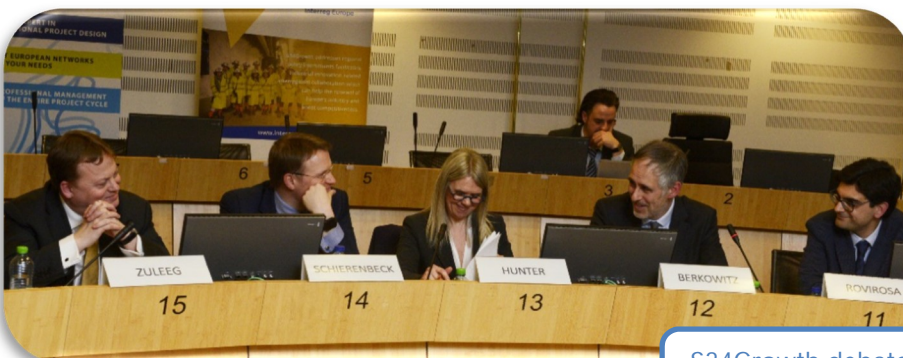
S34Growth debate in Brussels