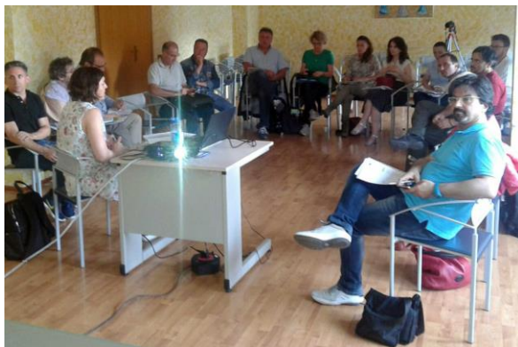
IMPACT Steering Committee (Isernia)