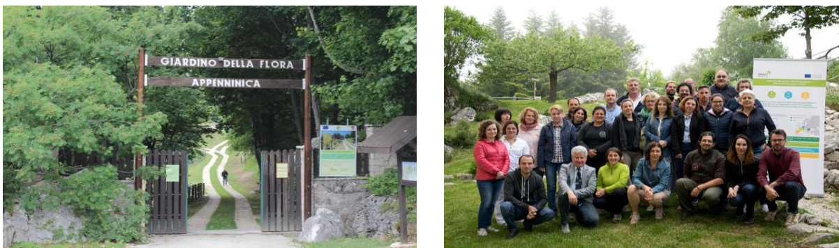
Study visit of the Botanical Garden of Appennine Flora, Capracotta (IS)

After lunch, held in the Reserve, there was the transfer to the Municipality of Capracotta (IS) and the study visit of the Botanical Garden of Appennine Flora. Established in 1963, the Garden is placed at 1525 meters above sea level and is one of the highest in Italy. It is a symbol of the Lobelia Aquarius , a tree spread in Molise forests and exclusive of the central-southern Apennines. It covers over ten hectares and is a natural botanical garden where the plant species of the native flora of the Central-Southern Apennines are preserved and protected. The Consortium, established in 2003, between the University of Molise, the Municipality of Capracotta and the Molise Region, ensures its promotion and management through the Department of Biosciences and Territory of the University of Molise. The Garden is engaged in several biodiversity research and conservation projects.