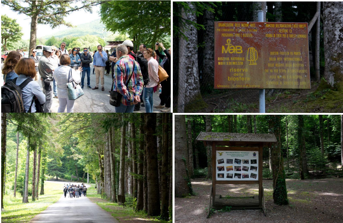
Study visit in the MAB Collemeluccio-Montedimezzo Alto-Molise Reserve (IS)

pastoral landscape, gives to the entire territory of the Reserve a wide value in the conservation and enhancement of the biological diversity and cultural landscape of Molise Region.