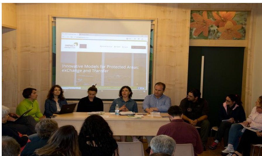
Stakeholder Round-Table « Exchange on Good Practices »