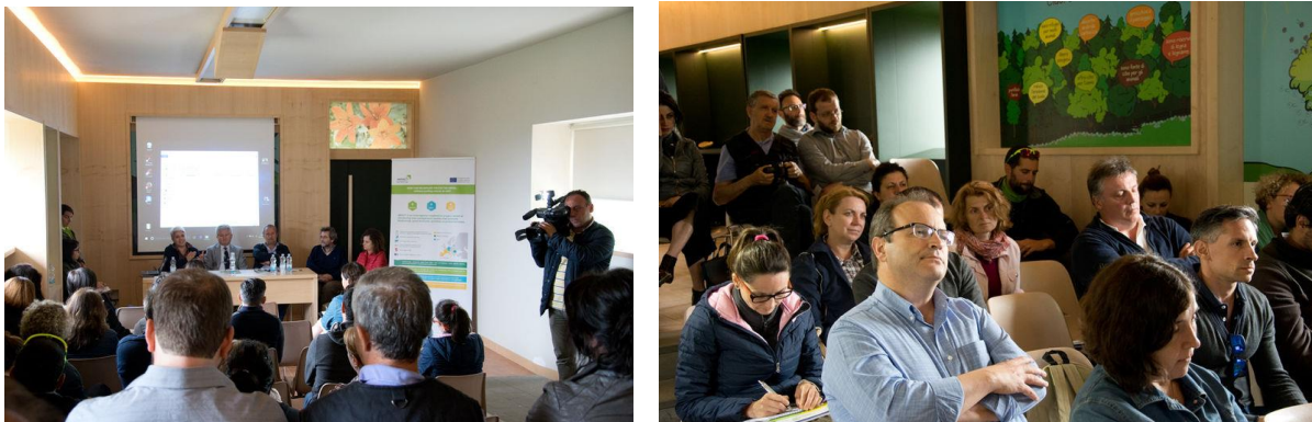
Interregional Event – Conference Room of the Botanical Garden of Appennine Flora, Capracotta (IS).

The meeting was concluded with a round table during which there was an exchange of ideas and experiences between the IMPACT partners and their stakeholders.