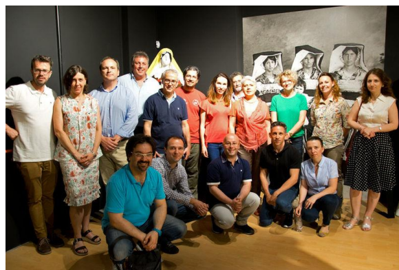
Visit of the Museum of the Molise costumes (IS)

The study visit started in the morning of the 8th of June with a field trip in the MAB Collemeluccio-Montedimezzo Alto-Molise Reserve (IS). The UNESCO Man and Biosphere (MaB) of Collemeluccio-Montedimezzo Alto-Molise Reserve, recognized and included in the World Network of the UNESCO Program in June 2014, is aimed at the protection and enhancement of environmental resources, the promotion of the territory through the creation of services in the cultural, tourist and social sectors and in establishing a network system for the valorisation of the territories of the municipalities chairing the consortium: Carovilli, Chiauci, Pescolanciano, Pietrabbondante, Roccasicura, San Pietro Avellana and Vastogirardi. The forest guards, leading the study visit, explained that the Reserve covers an area of 25,000 hectares. The presence of 7 sites of European Community relevance (Natura 2000), characterized by 12 different habitats and several archaeological sites and aspects of the silvo-