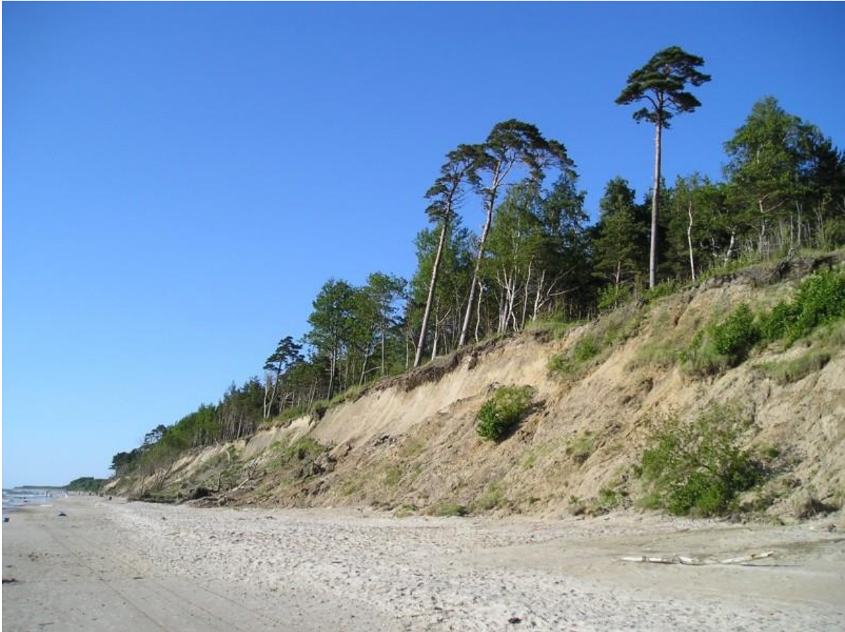
Pajūris regional park.