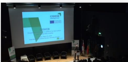
3 rd CISMOB Thematic Conference

The 4th CISMOB Main Interregional event can be accessed by clicking on the images bellow: