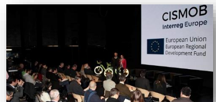
3 rd CISMOB Building Capacity Workshop