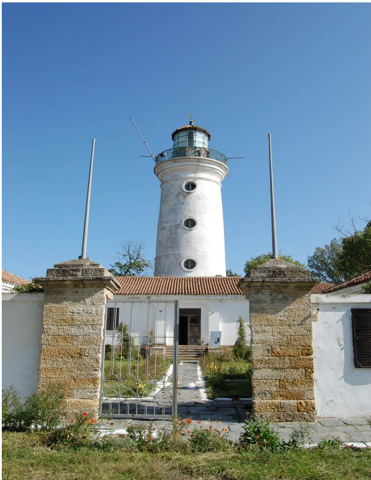
Lighthouse of European Comision of Danube (ATU Sulina)