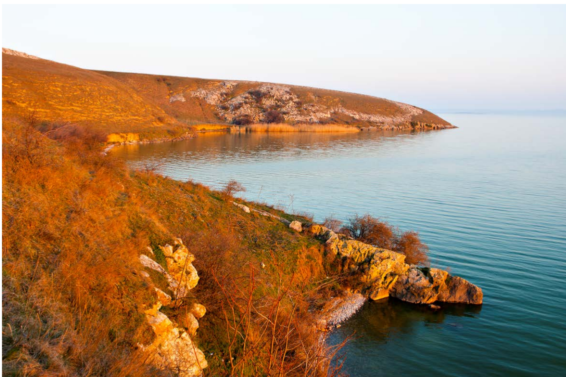
Popina Island – Lake Razim (ATU Sarichioi)