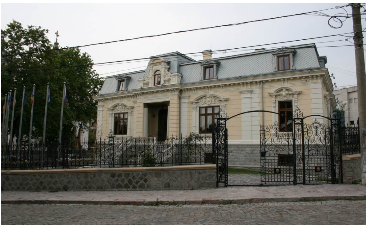
Avramide House (ATU Tulcea)