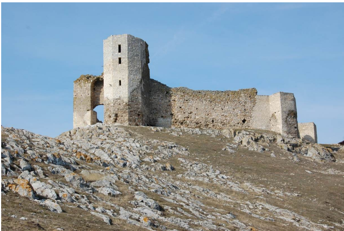
Enisala Fortress (ATU Sarichioi)