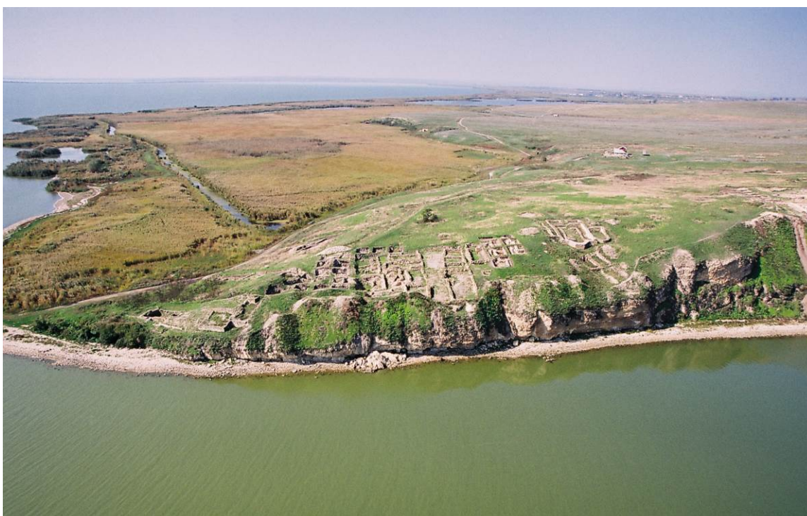
Orgame/Argamum archaeological site – Doloșman Cape (ATU Jurilovca)