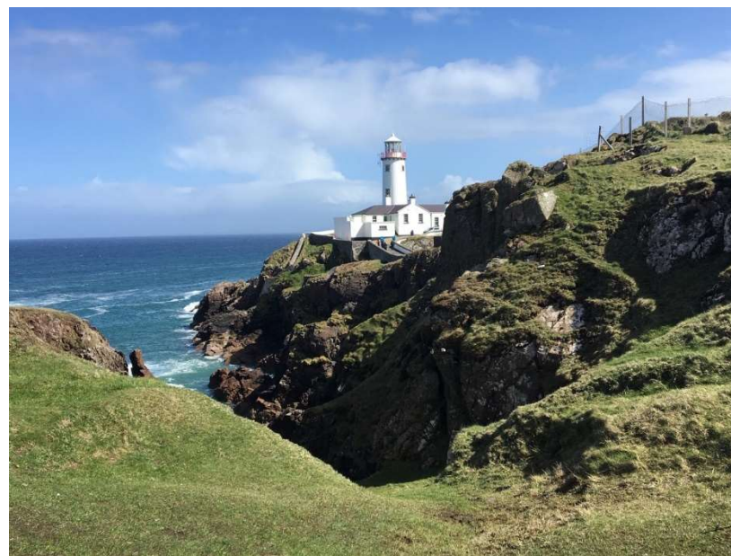
Seascape character assessment – Donegal county