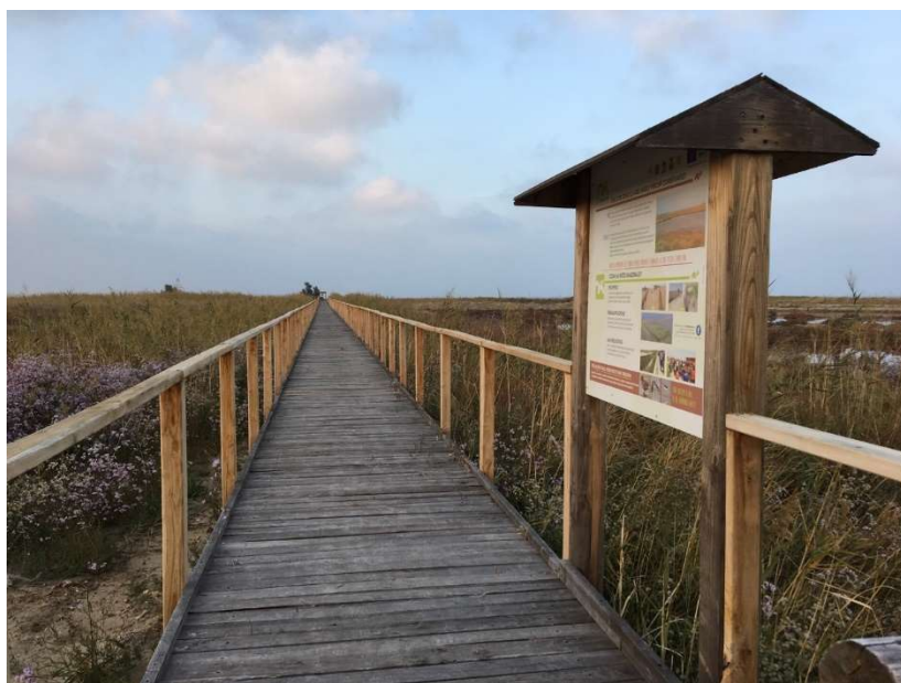
Life Maestrale – Molise region