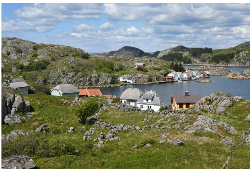
From the field study at the outpost Selør