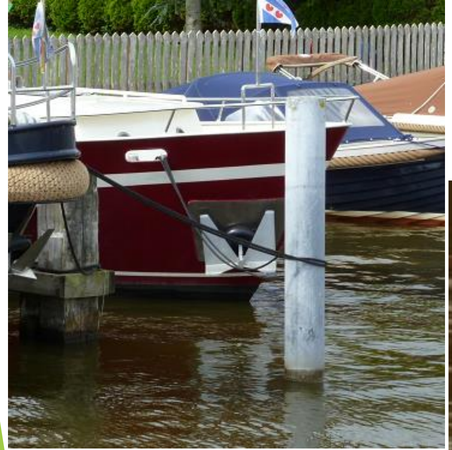
After 20 years