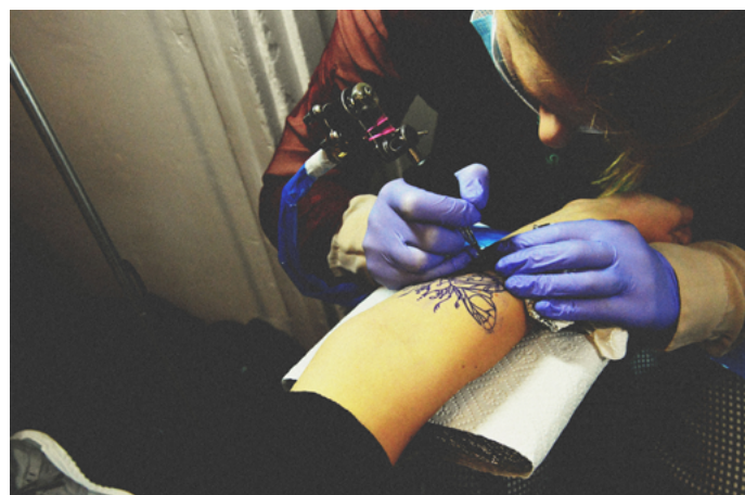
The URBACT Local Group supported designers and tattoo artists to spread their message

As part of the GEN-Y City network, Toruń's Municipality reached out directly to millennials to develop a solution. The city set up an URBACT Local Group made up of young business people, alongside representatives from NGOs and the university. Several of the participants were below 30. All agreed on the urgent need to reanimate the city's old town, which they saw as expensive and lacking in energy. Using URBACT methods, the group proposed various small-scale initiatives, including volunteer walking tours and regular street food festivals, to bring some new life to the area. They also identified an urgent need for co-working spaces and other physical incubators, to encourage cooperation across sectors.