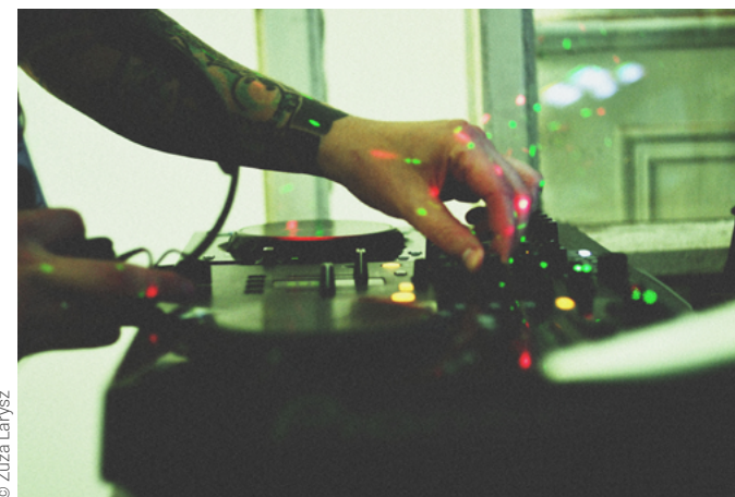
Music has been an important part of unlocking the city's youth culture

A major turning point came in 2016 at the URBACT Summer University in Rotterdam (NL) when representatives from the local group discovered other models of collaborative