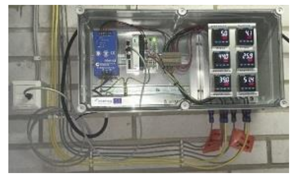
Real-time consumption values on the tailored dashboard.