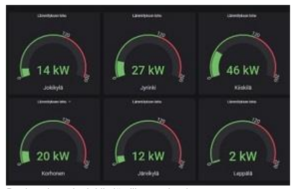
Device closet in Jokikylä village school

Now, as a result of the Act Now! project, all 6 village schools are now equipped with a sensor system, enabling remote monitoring and logging of energy consumption. In the biggest school, there is also a hot tap water consumption monitoring as a separate function.