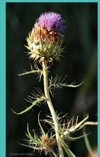
Fotografía de Arturo López Gallego