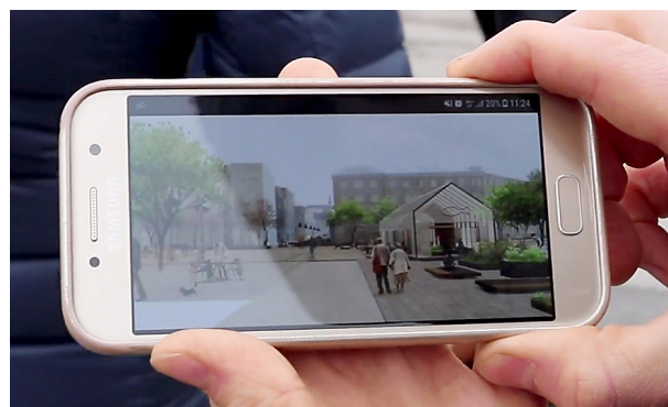
The AvaLinn app.

To encourage co-creation and to offer an easy way to give feedback on different development plans, the city of Tallinn developed a mobile app. The AvaLinn app – meaning open city – was launched in January 2018 for iOS and Android phones/tablets. AvaLinn makes it possible for local stakeholders to co-create the urban space along with the local council by expressing their ideas and giving feedback on plans.