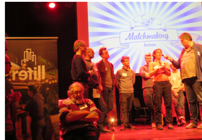
Ghent's Match-Makers event