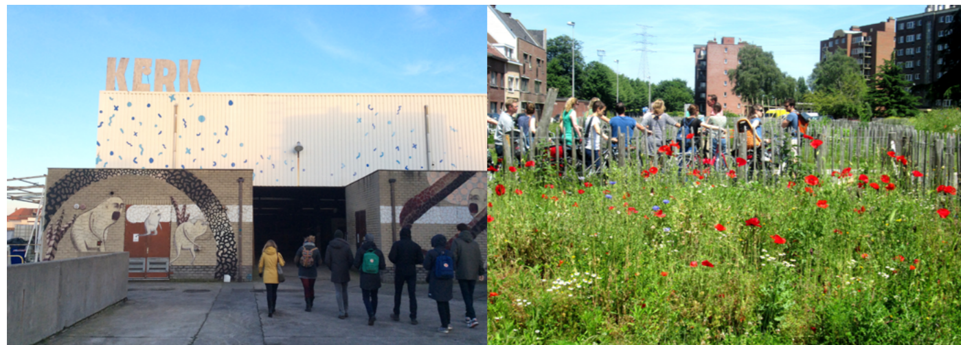
URBACT Local Group visit temporary use projects in Ghent

Because of this wealth of experience – matched with the desire to formalise such activity, evaluate best practice and collaborate internationally – Ghent became Lead Partner for the URBACT REFILL network.