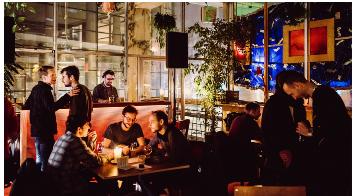
NEST: a sense of creative community

Ghent also improved communication and promotion of temporary use projects – which are shown in a digital map on the City of Ghent website. A university study provided a framework for assessing the impacts of temporary use, which the city now hopes to implement. And what started as the REFILL local group will continue as a temporary use learning network, backed by the city’s Policy Participation Service, of which the neighbourhood managers are part.