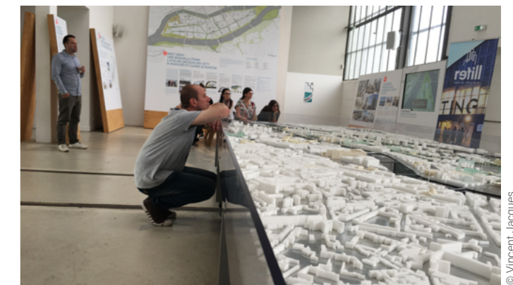
Partner cities visiting Nantes