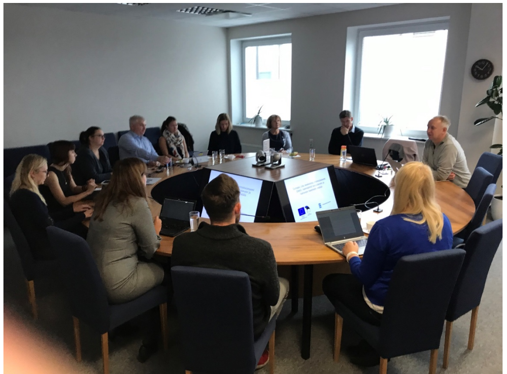
Photo: Roundtable with stakeholders in October 2019 in Tallinn, Estonia

In addition, a study has been initiated to analyse the feasibility and economic cost regarding the simplification of the environmental permit application as well as the reduced reporting and inspection requirement. The study aims to explore whether and to which extent the information and environmental data provided in the EMAS statement is applicable in the current permitting and reporting system. The study includes a questionnaire for companies with environmental permits as well as roundtables with relevant authorities and companies. The questionnaire and roundtables were carried out in autumn 2019. The study will be the basis for finalising the list of measures that will be implemented to improve the policy instrument identified for ENHANCE project in Estonia. The study will also provide input for necessary legal amendments needed to improve the policy instrument.