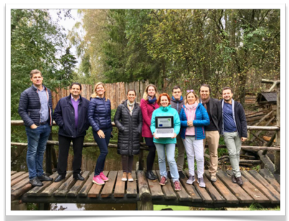
Project meeting in Tallinn