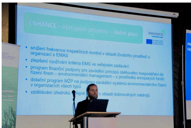
Presentation of the ENHANCE project at CENIA's conference in the May 2019

For the next month, CENIA will focus on developing the training program for the public authorities.