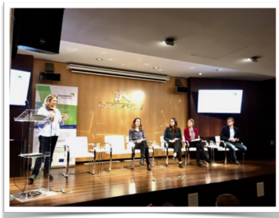
Dissemination event in Barcelona

1 Project Meeting in Tallinn (Sept. 2019)