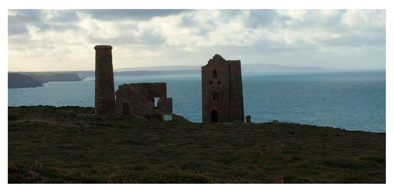
Figure 1: Wheal Coates engine house located near St Agnes in Cornwall's World Heritage Site.

Cornwall and the Isles os Scilly are uniquely positioned to develop uses of renewable energy, and the growth of the renewables sector in the UK has lead to the development of renewable energy businesses based in Cornwall. Besides wind and solar farms, there is research on marine renewable energy (www.fabtest.com, www.wavehub.co.uk) and a deep geothermal power generation project (https://www.uniteddownsgeothermal.co.uk/) at United Downs (Fig. 2).