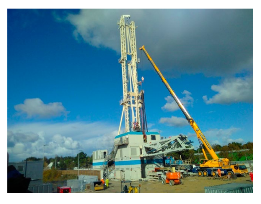
Figure 2: Deep geothermal project at United Downs, October 2018

Cornwall and the Isles os Scilly are uniquely positioned to develop uses of renewable energy, and the growth of the renewables sector in the UK has lead to the development of renewable energy businesses based in Cornwall. Besides wind and solar farms, there is research on marine renewable energy (www.fabtest.com, www.wavehub.co.uk) and a deep geothermal power generation project (https://www.uniteddownsgeothermal.co.uk/) at United Downs (Fig. 2).