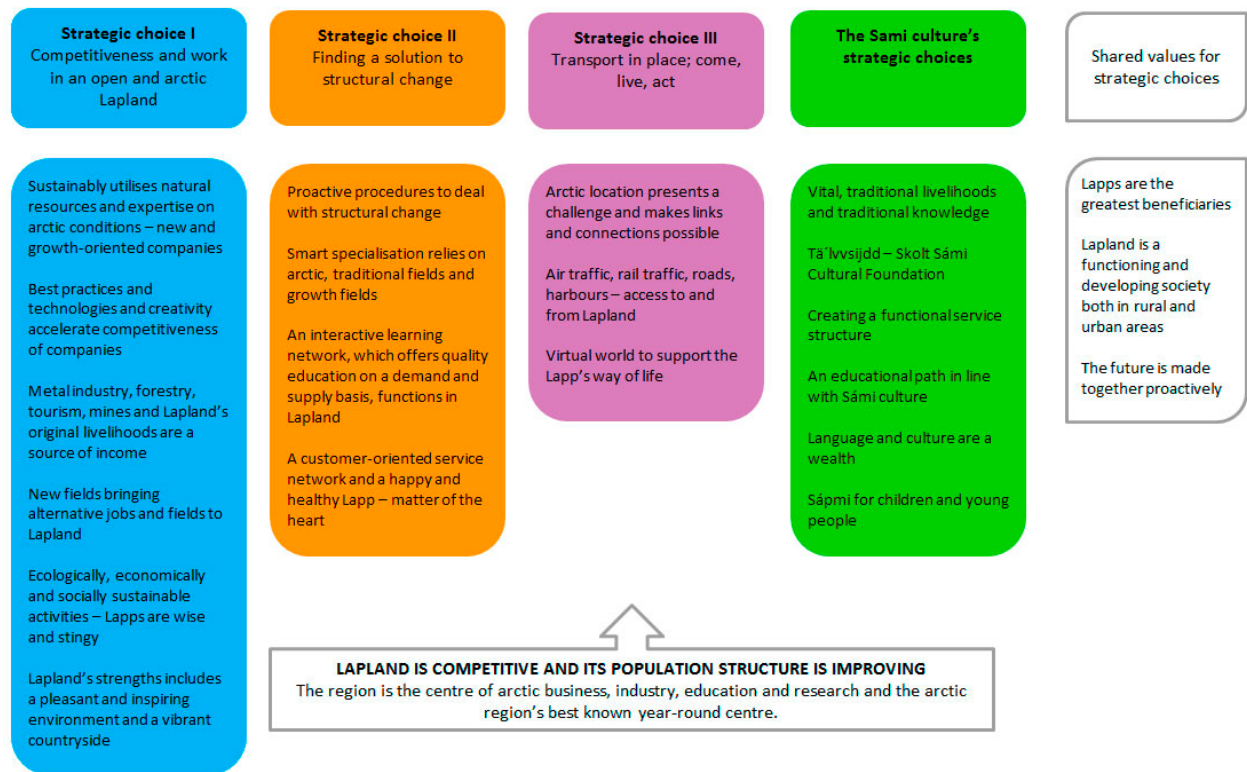
Figure 1: In Lapland, Strategic choice I supports this action plan implementation and links the operational programme to the regional development and specialisation. Reference: http://www.rakennerahastot.fi/web/en/lapland

LAPLAND REGIONAL PROGRAMME 2014–2017 STRATEGIC CHOICES DEVELOP THE ENTIRE REGION