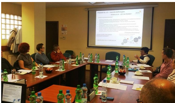
stakeholders' meeting on 09.11.2018