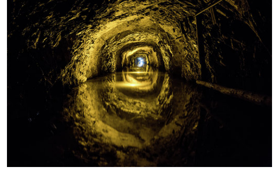
Złoty Stok complex