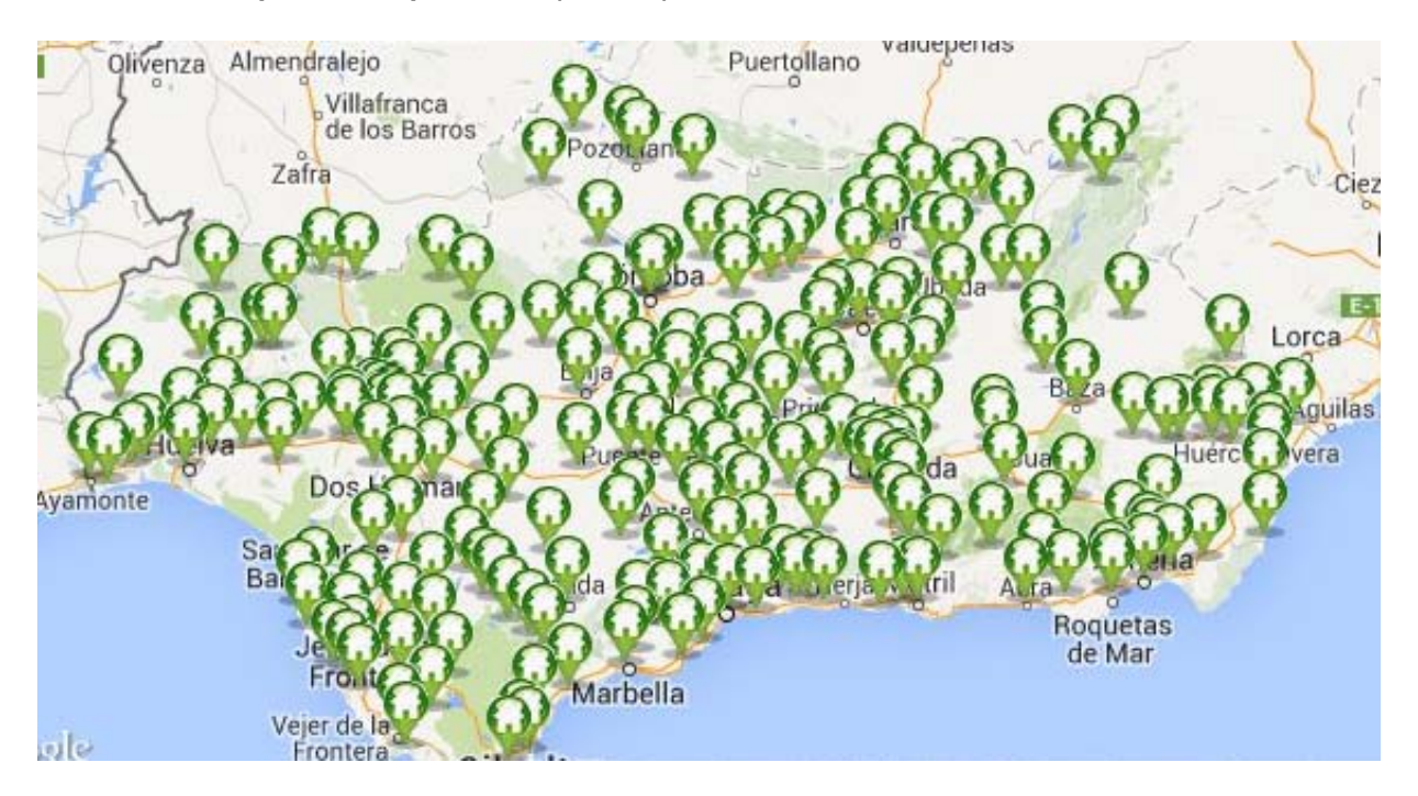
Gráfico 1. Entrepreneurship Centres (CADEs) in Andalucía

In addition, the Foundation manages or fosters, in many cases in collaboration with other entities, specialised programmes, either to enhance entrepreneurial culture (Program Innicia Cultura Emprendedora), encourage the acquisition of entrepreneurial skills among young people (Music Hero, Talent Entrepreneur, University CADEs) or promote the creation or acceleration of innovative and technology-based companies (CelerAEmprende, Minerva, Andalucía Open Future, Aeronautical Incubator), or in specific sectors: creative industries (Lunar Project), tourism (Torremolinos Accelerator).