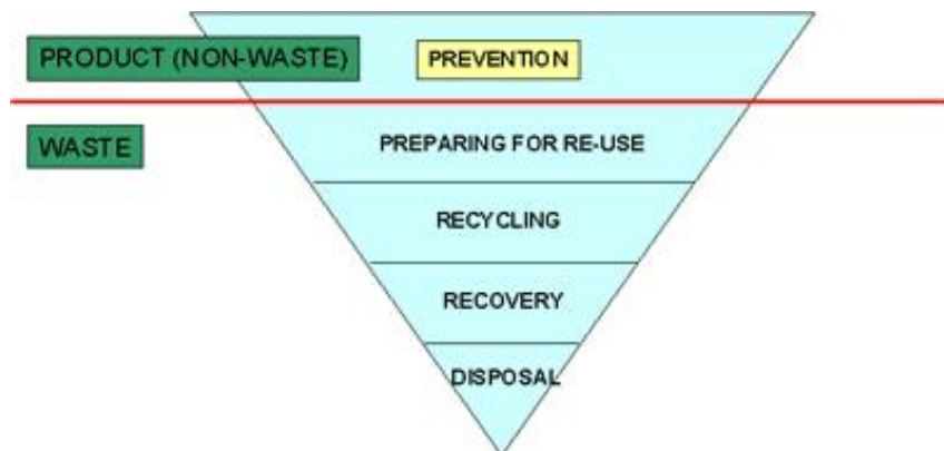
Figure 1. The waste management hierarchy (Directive 2008/98/EC on waste)

The Waste Framework Directive (Directive 2008/98/EC on waste) sets the basic concepts and definitions related to waste management, such as definitions of waste, recycling and recovery. It explains when waste ceases to be waste and becomes a secondary raw material when applying end-of-waste criteria, and how to distinguish between waste and by-products. Waste legislation and policy of the EU Member States are required to apply as a priority order waste management hierarchy shown in the figure 1 below. As the figure shows waste prevention is the first step material management when the product has not yet gained the waste status and which should be taken into consideration already in the making and usage of the product. After that the material, now already under the secondary raw material, by-product or waste status, should according to possibilities be firstly prepared to reuse, recycled or recovered in other ways, such as energy in this hierarchic order. Disposal e.g. landfilling is the least favoured option.