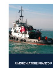
RIMORCHIATORE FRANCO P.

ILMA S.R.L. DISPONE DI DIVERSE UNITÀ NAVALI ADIBITE AL SERVIZIO DI: RIMORCHIO D'ALTEZZA, A BARGE HOTEL, CRANE BARGE, TRASPORTO E SOLLEVAMENTO DI MATERIALE.