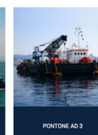
PONTONE AD 3