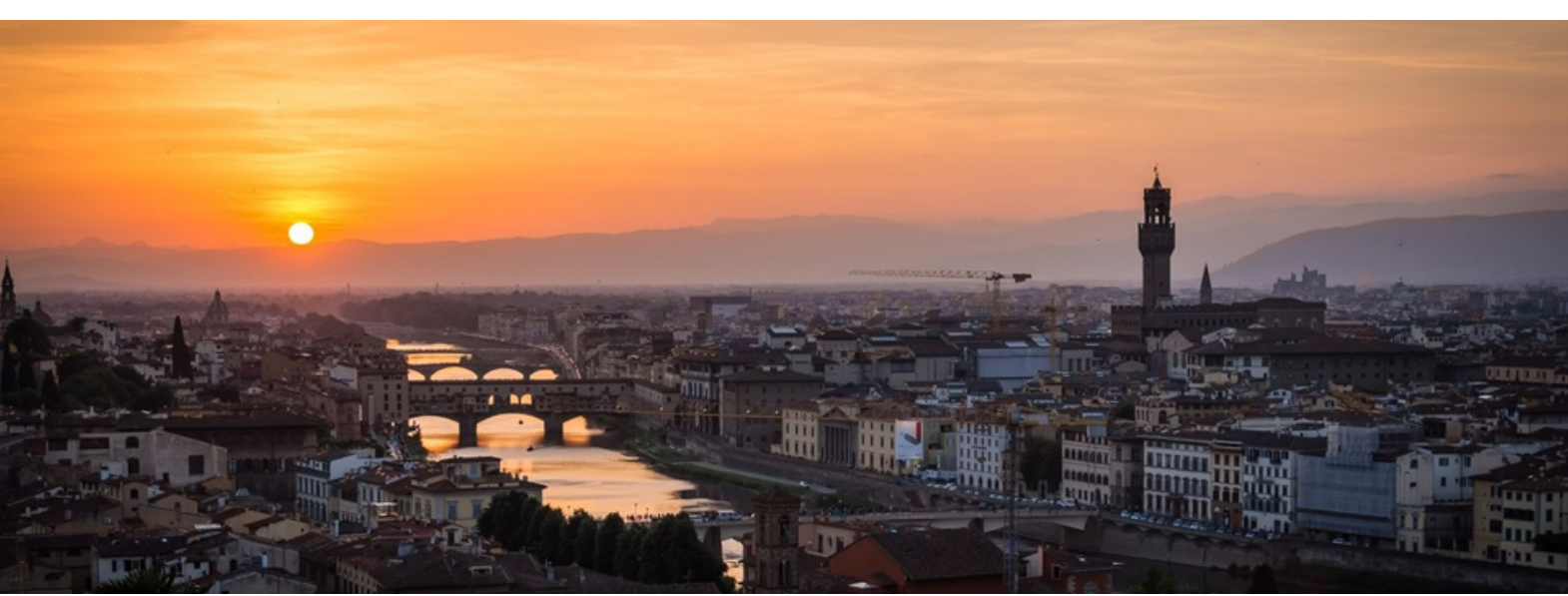
Florence Sunset"

Sharing of the results of the sentiment analysis and nudging experimentation with project partners and also outside the project, thanks to the Herit-Data capitalization process, too.