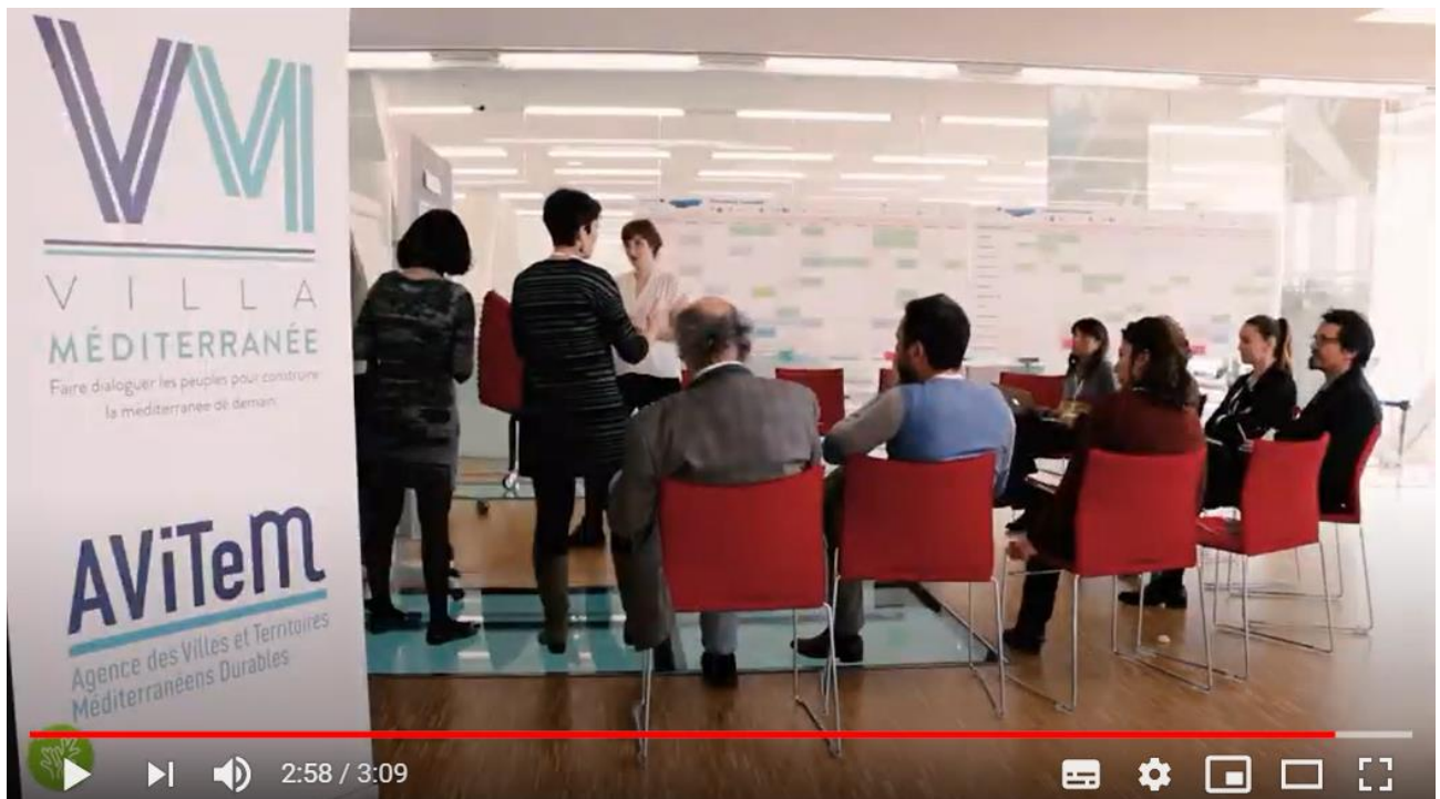
(SNAPSHOT FROM THE EVENT VIDEO CLIP AVAILABE AT https://www.youtube.com/watch?v=LTF0W83JUJ&FEATURE=Youtu.be )