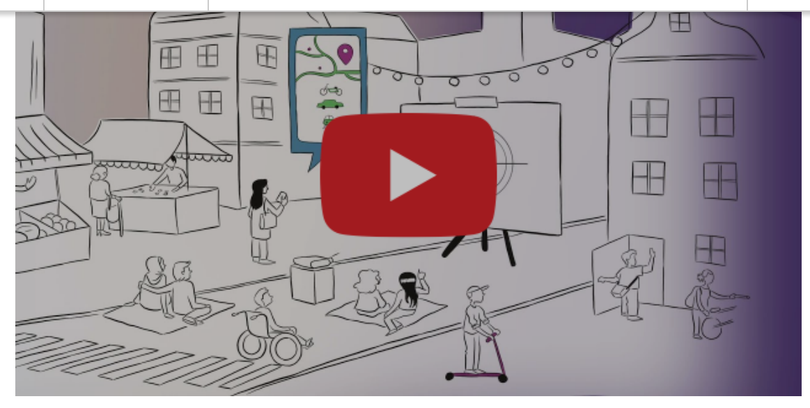
We are happy and proud to be able to share the video "A Day of Multimodal Mobillity" with you. The video illustrates the activities and results of cities.multimodal.