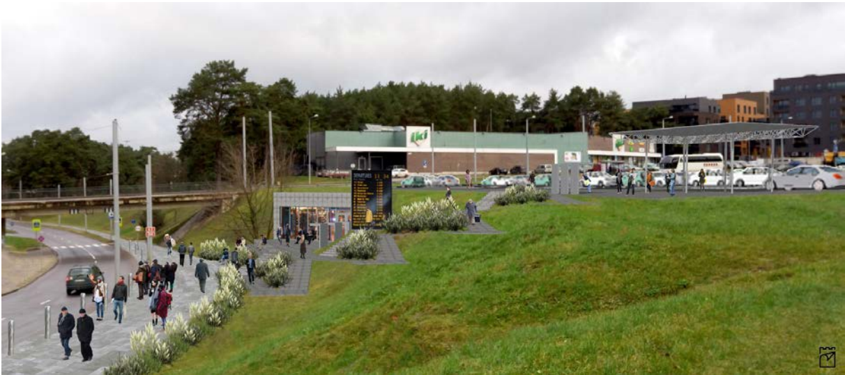
Draft visuals of the project