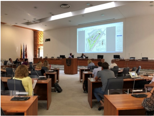
Photos from the meeting in August