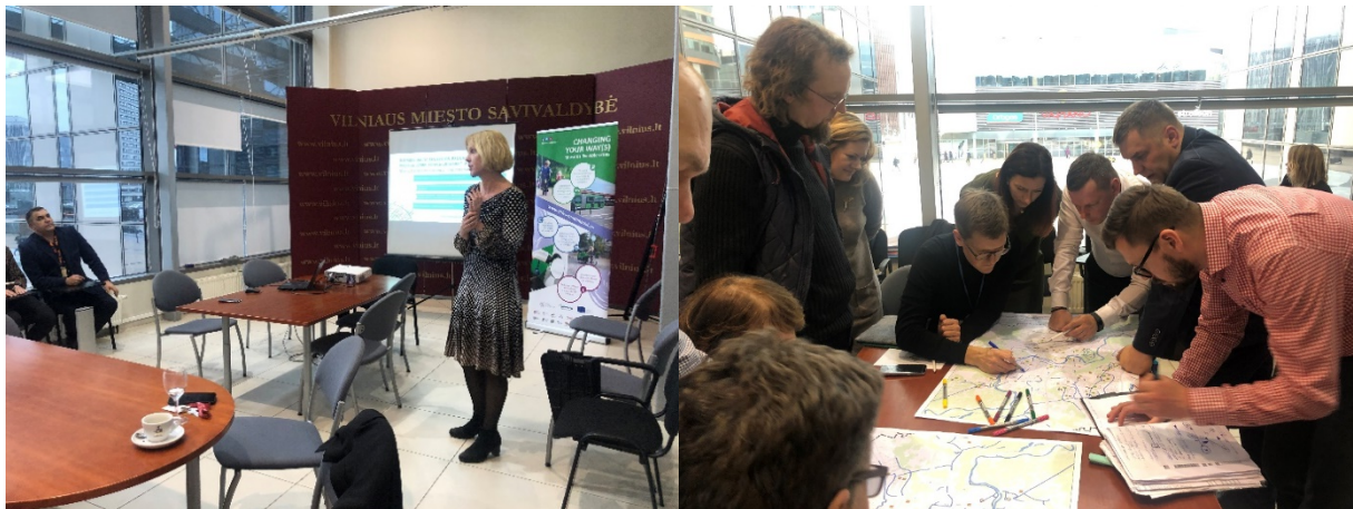
Photos from the event

enterprises as recommendations for expanding multimodality network, as well as recommendations for the other stages of the bicycle storage project etc.