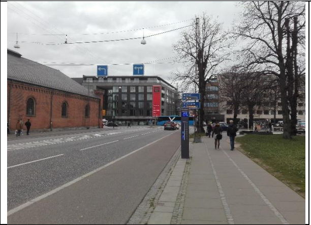
Bike infrastructure – new cycling path equipped with cycling counter...