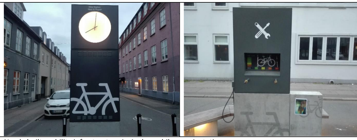
Newly built mobility infrastructure in Aarhus – bike repair station.