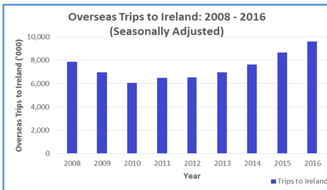
Figure 2: Overseas trips to Ireland: 2008 – 2016

It is important to set this report in the context of the wider economy and the Marine Leisure Industry. The Irish economy has experienced a prolonged economic recession 2008-2013 with a current economic growth of 5.2% for 2016, from -4.0% in 2009 and unemployment at 6.8% in Quarter 2 2017, from a high of 15.1% in Quarter 3 2011 (CSO, 2017a; CSO, 2017b). The recession also had a significant effect on tourism. Overseas trips to Ireland decreased from 7.8 million in 2008 to 6 million in 2010 (a 23% decrease), while increasing again to 9.6 million in 2016 (CSO, 2017c). Figure 2.1 provides further information on overseas trips to Ireland, post financial crisis (2008).