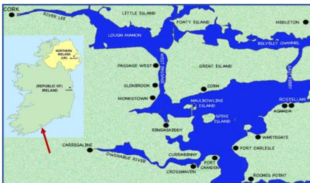
Figure 1: Cork Harbour and its location in the South west region of Ireland

The study will also contribute to the wider tourism, marine and regional debates. More specifically, the adoption of an economic multiplier appropriate for the Irish Marine Leisure Industry. This will facilitate similar studies in Ireland and indeed along the Cool Route. It is, to the best of the authors' knowledge, the first such report in an Irish context. Figure 1.1 provides a map of Cork Harbour and its location in the South West region of Ireland, the general area covered by this report.