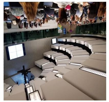
Figure 3 – name.