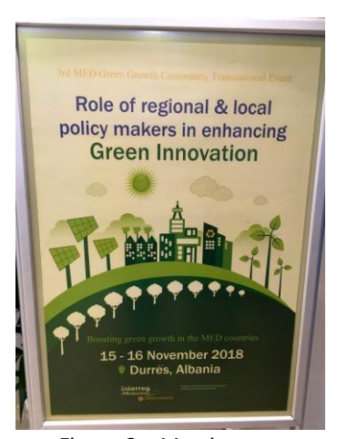
Figure 2 – Meeting poster