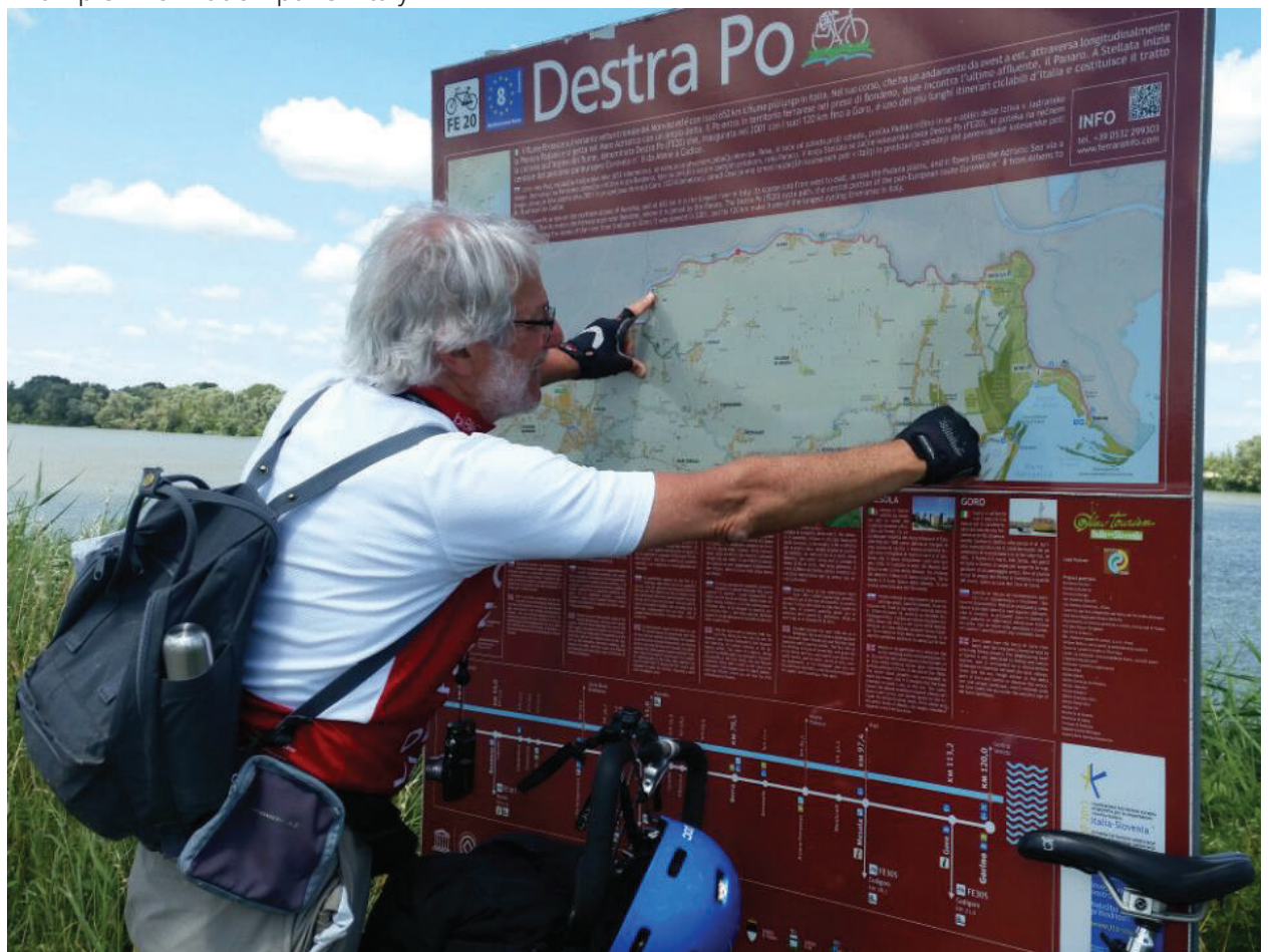
Example information panel: Italy

The following examples show how the graphic features of the EuroVelo 8 – Mediterranean Route can be used to communicate and promote the route.