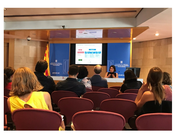
Seminar to present the results of CESBA MED at regional level

The Seminar "New strategies for the Development of Mediterranean Sustainable Cities" took place in