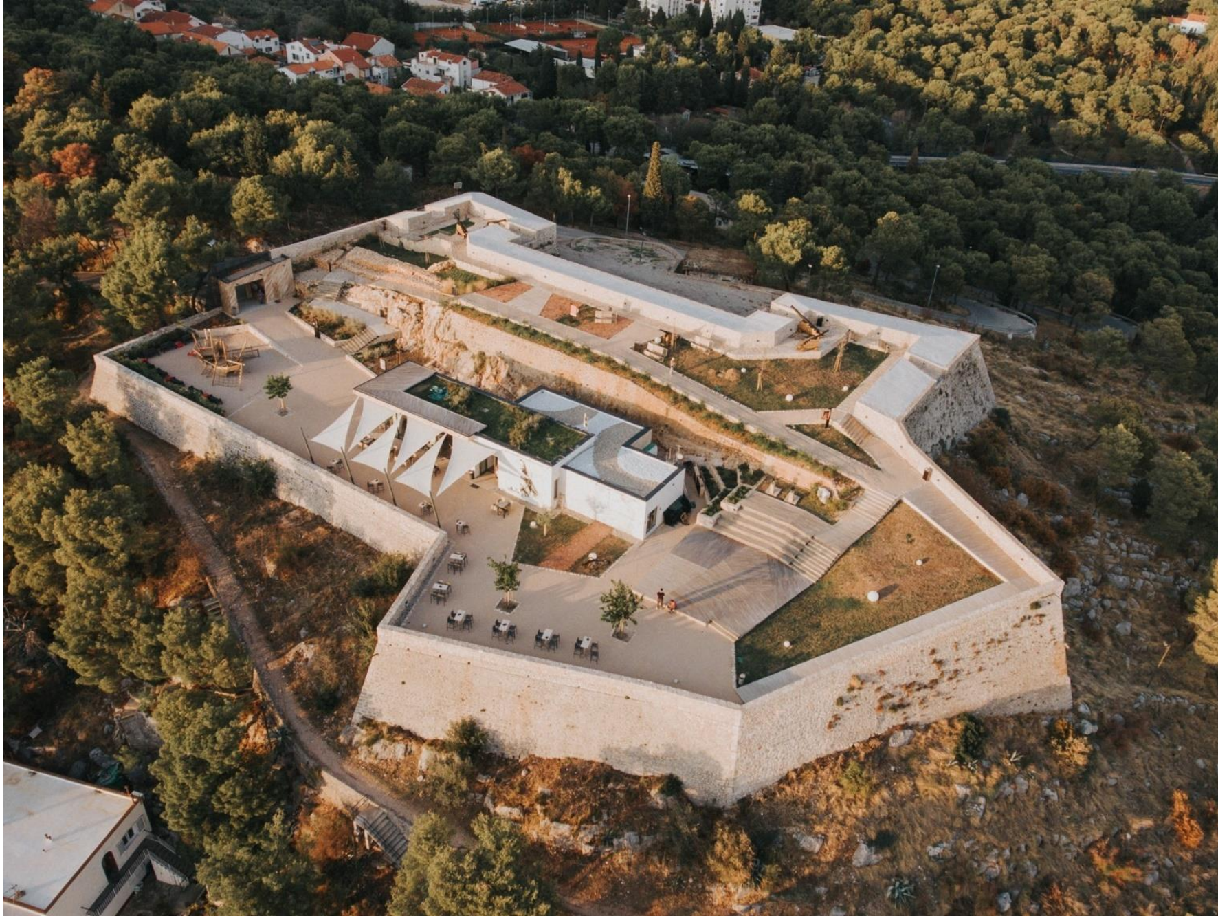
TVRĐAVA KULTURE ŠIBENIK