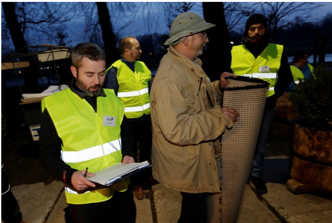
Fig. 9: Exercise organizers checking the correct development of the exercise.