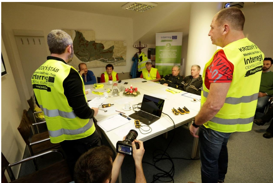
Fig.6: Monitoring the development of the situation at the Crisis Centre