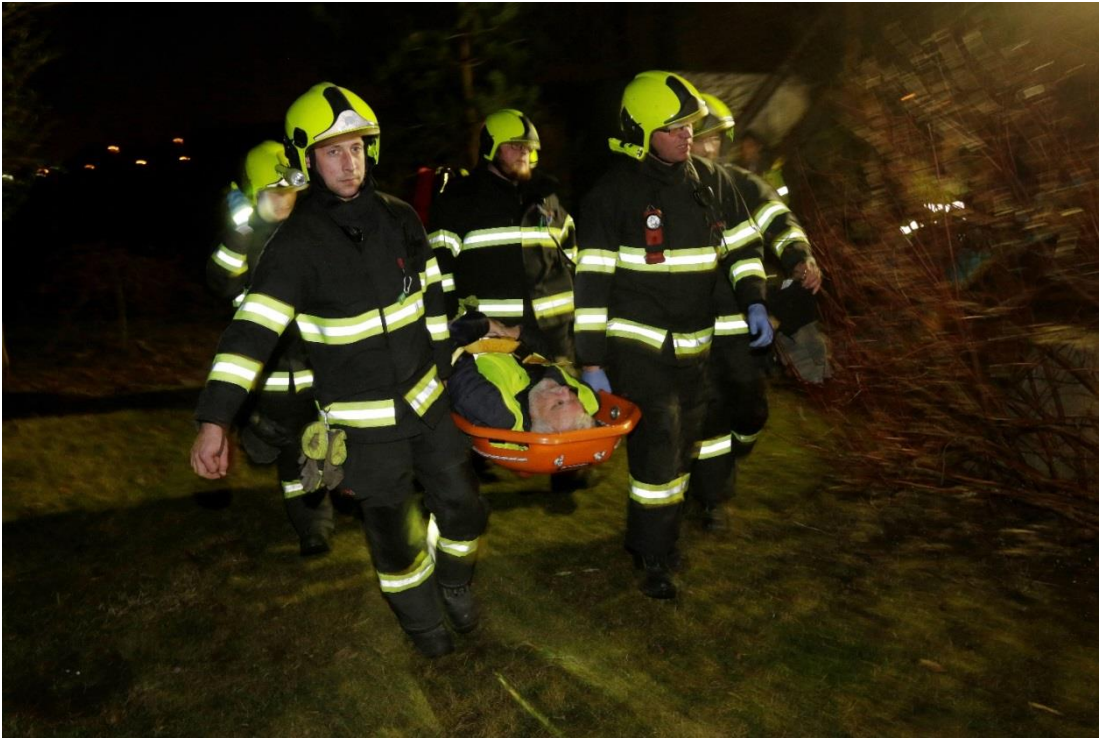
Fig. 13: Rescue and stabilization of injured person.