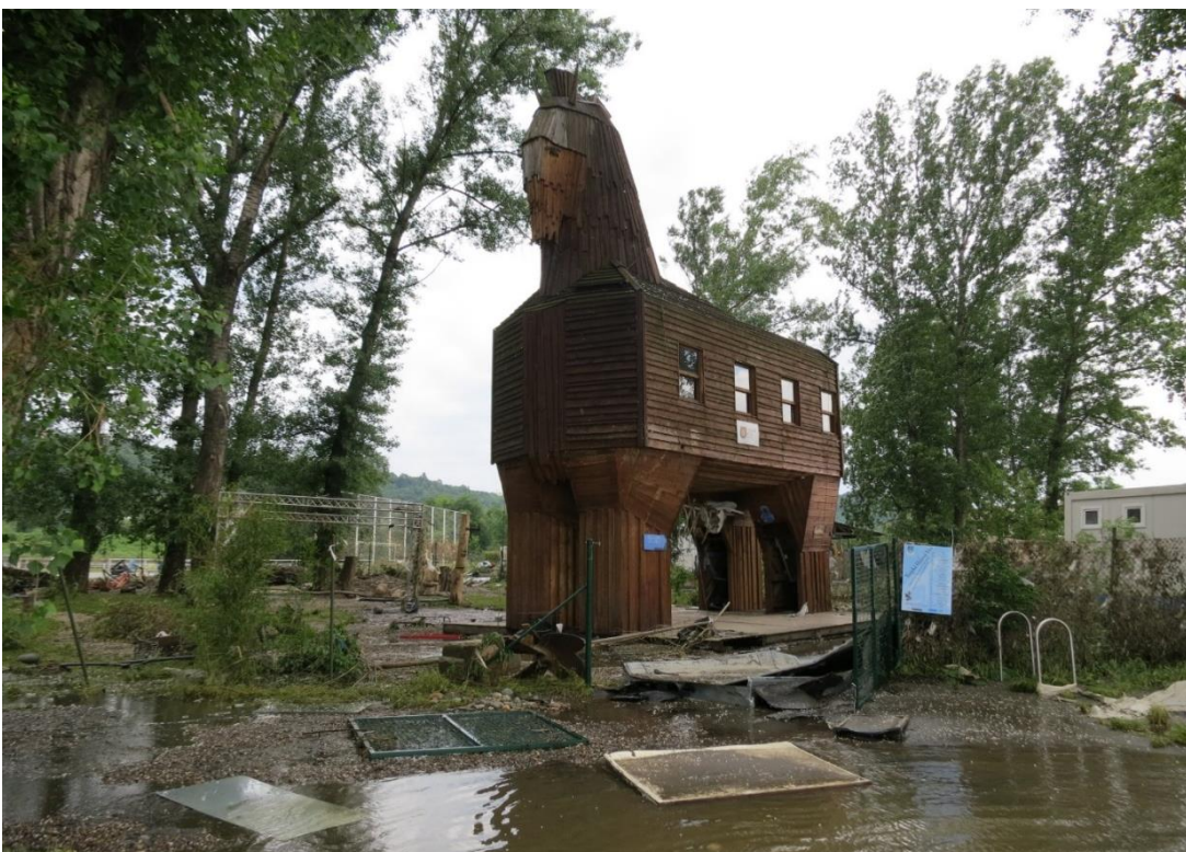
Fig. 2: Trojan Horse Gallery, Prague in June 2013 after flood