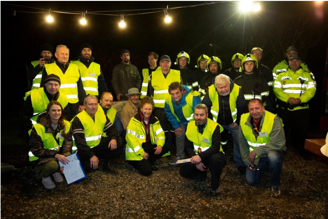
Fig. 14: Participants to the exercise.