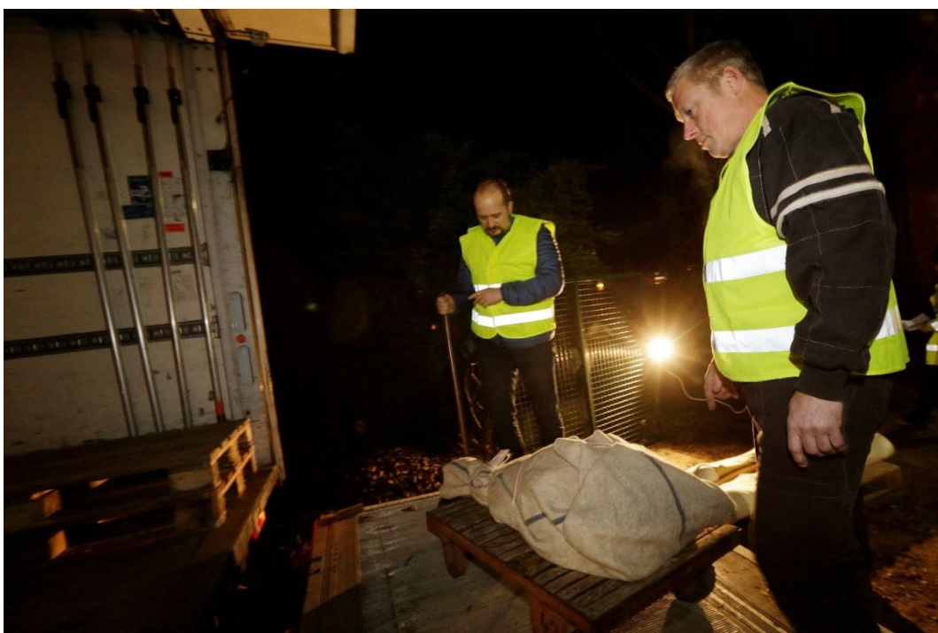
Fig. 10: Loading of packed artwork to be evacuated and stored at a safe location