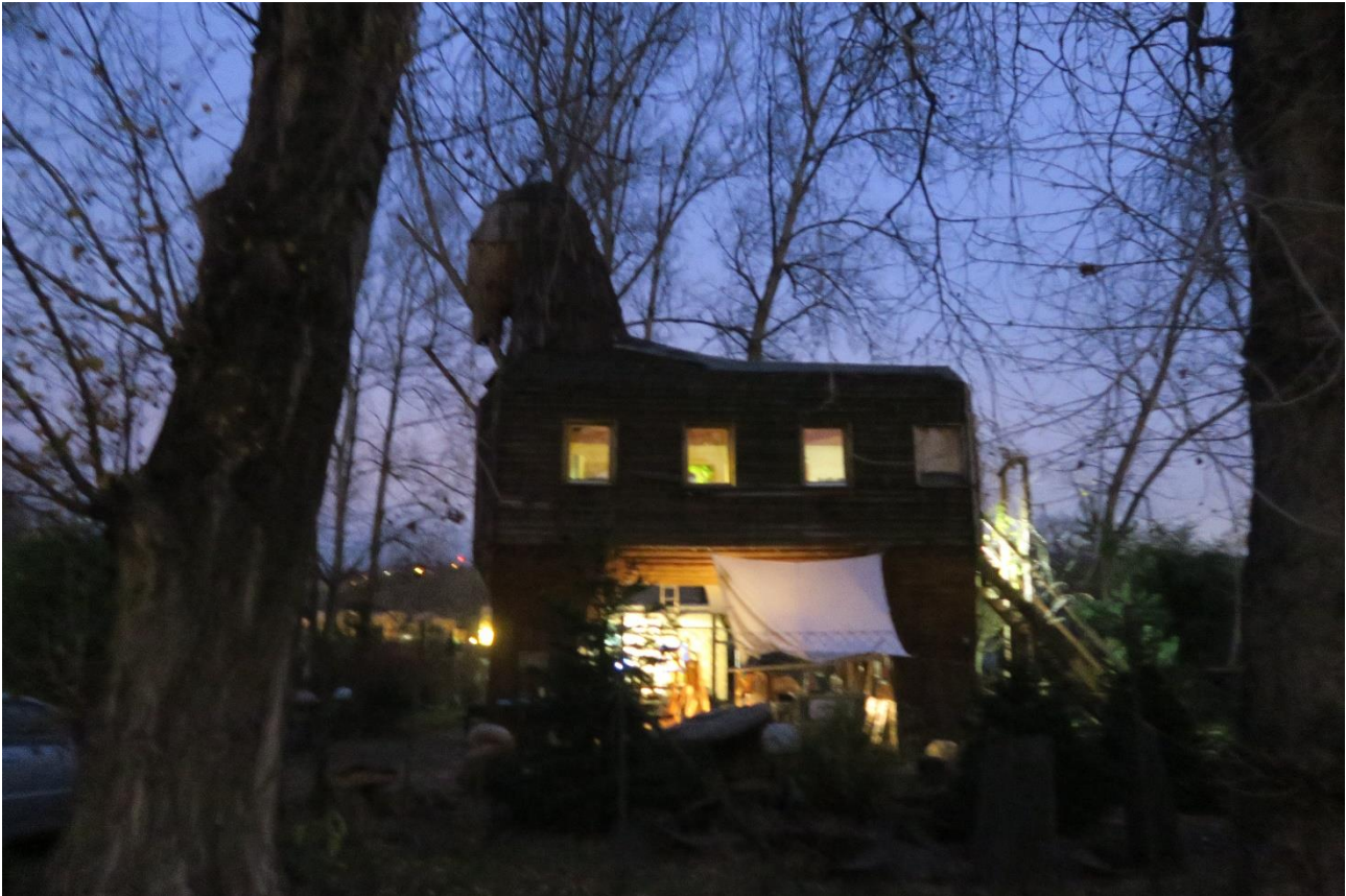
Fig. 5: Night view of the gallery