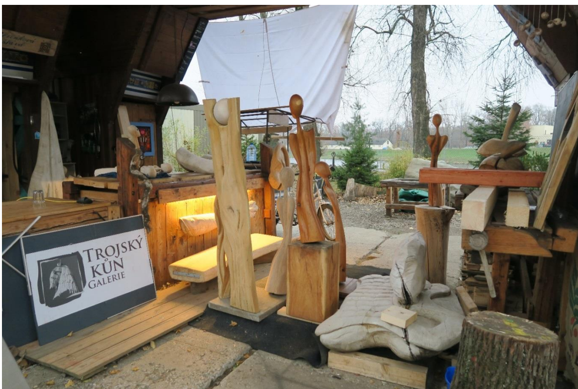
Fig. 4: View of the main exhibition space under the horse