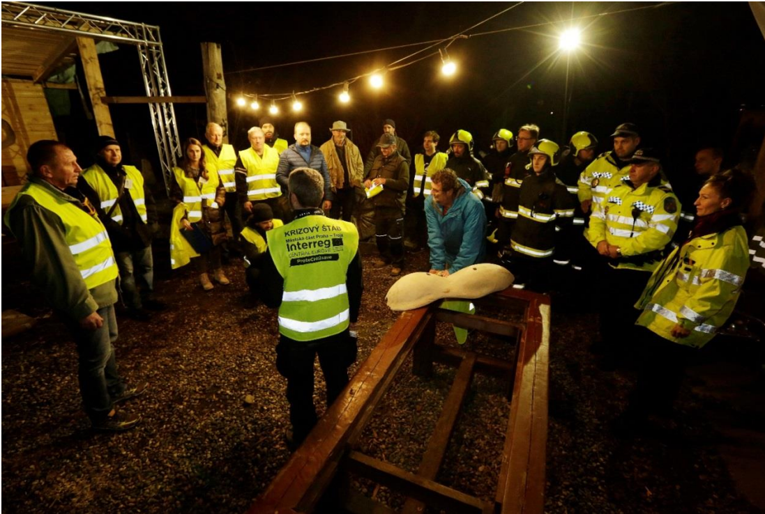
Fig. 15: Official closure of the event.