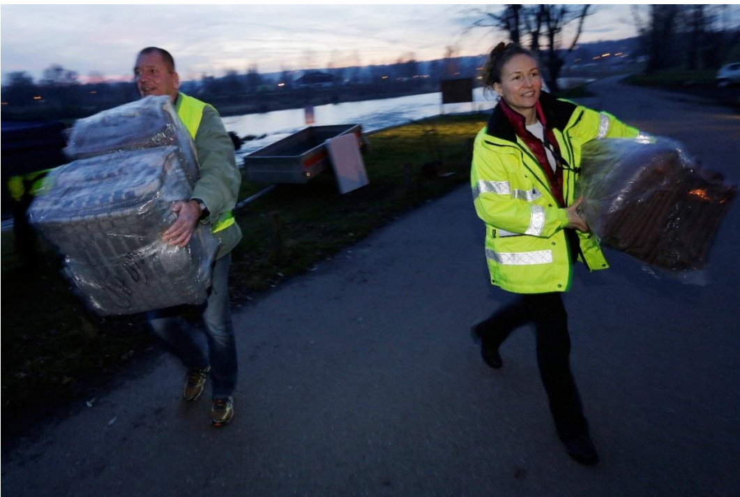
Fig.8: Arrival of packing material at the site.