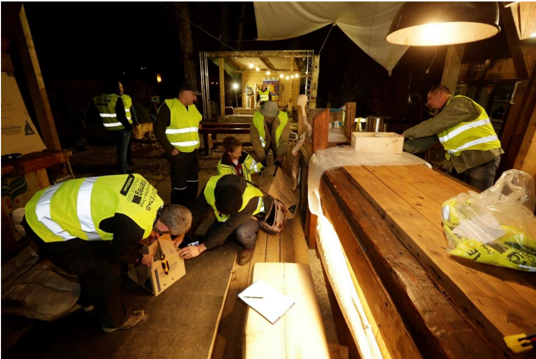
Fig. 12: Assembling boxes for evacuation of lighter objects.