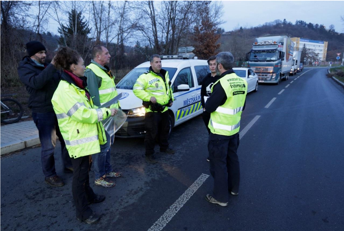
Fig.7: Briefing with the Municipal Police before entering the pilot site with trucks.