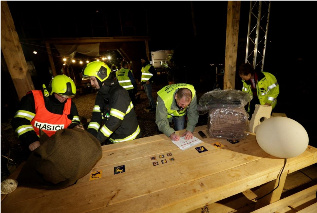
Fig. 11: Packing and labelling station on site.