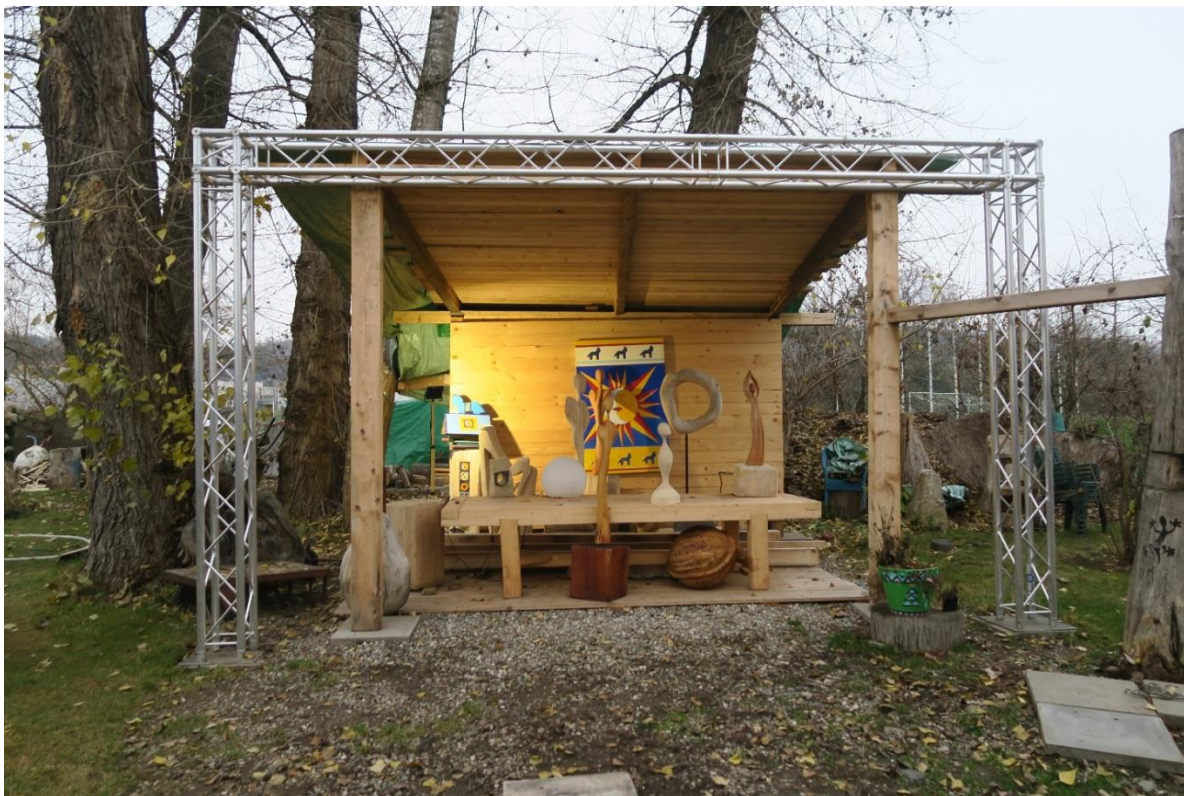
Fig. 3: Adjacent structure with part of the exhibition.