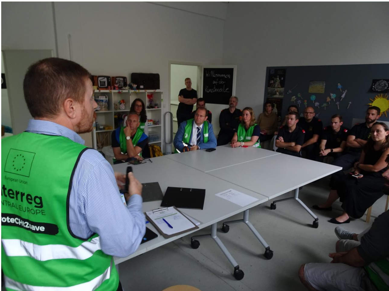
Fig. 1: Briefing the fire brigade and the volunteers before the exercise starts. (Schramm, 2019).