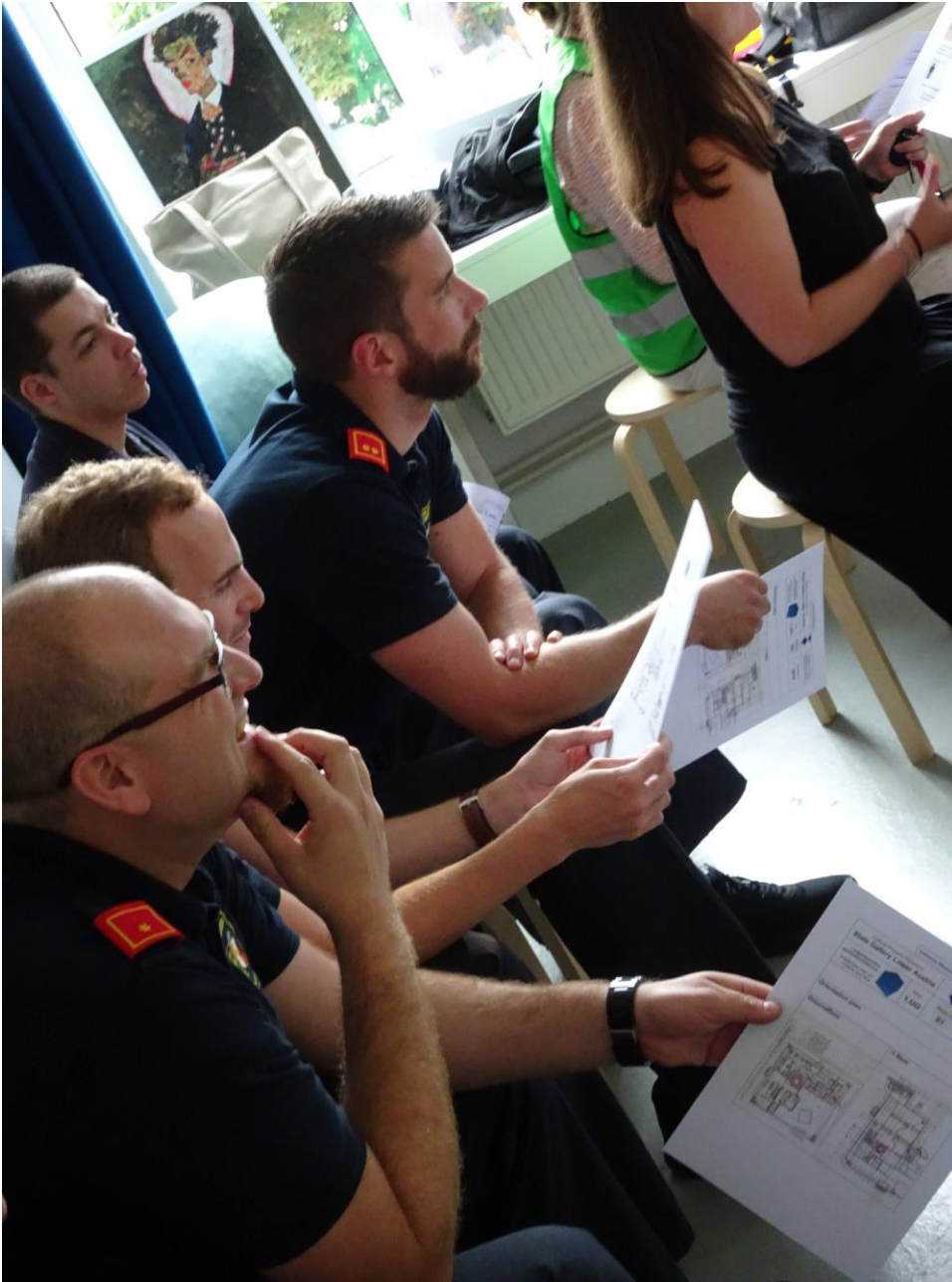
Fig. 2 Briefing the fire brigade and the volunteers before the exercise starts. (Schramm, 2019).