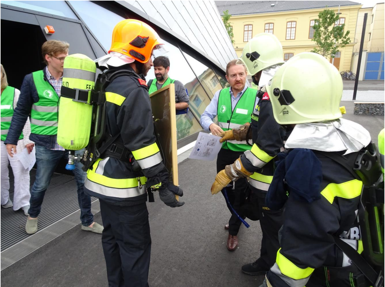
Fig. 5: Handing over the high-priority item outside to building to the volunteers transferring it to a safe storage area before the items can be brought to their final storage. (Schramm, 2019).