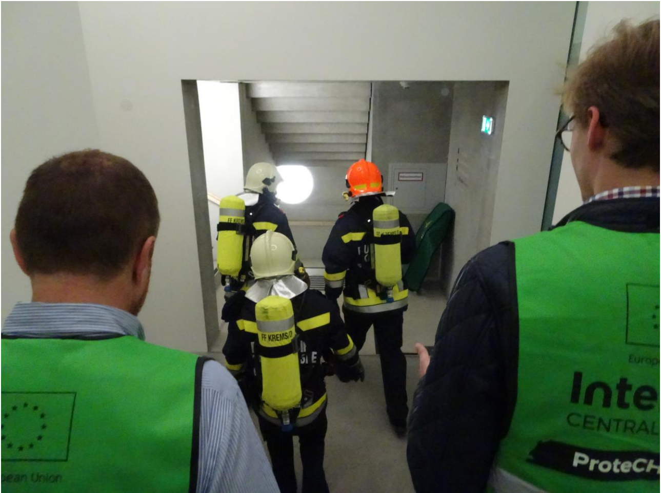
Fig. 3: The fire brigade has been alarmed, they have been handed the route cards and enter the museum in order to evacuate the high-priority items. (Schramm, 2019).