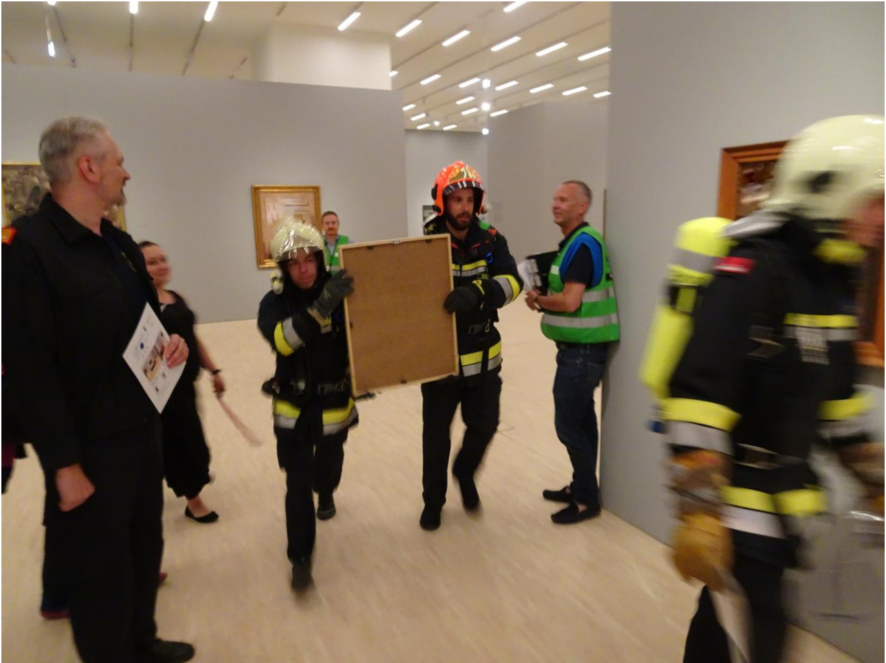
Fig. 4: Evacuation of the high-priority items by the fire brigade. (Schramm, 2019).