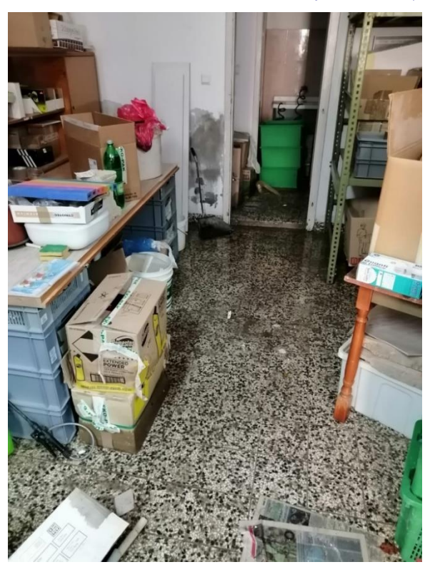
Figure 1. Evacuation exercise in the Kaštela City Museum (Kaštel Sućurac)