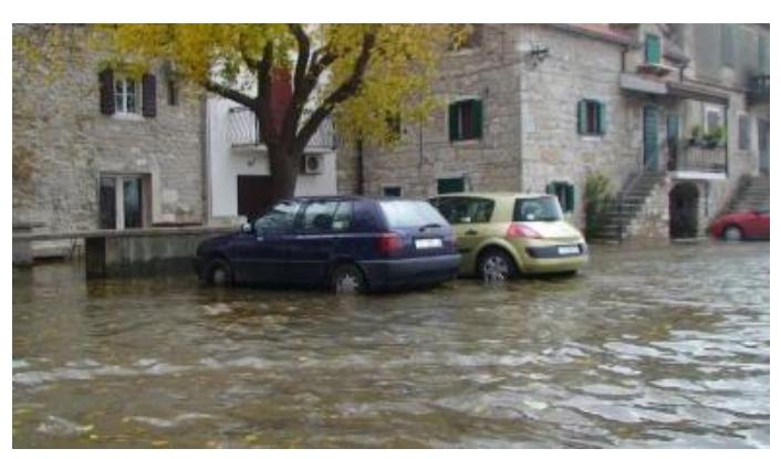
Fig. 1-3: The old town and threats posed by sea floods.