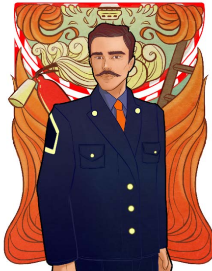
Fig. 4: EOC Director and Fire Chief.

The game has a contemporary art nouveau style, in homage to the Czech artist Alphonse Mucha who worked as illustrator, painter and photographer in the late 19th and early 20th century. User Interfaces, buttons, text screens, and images of characters are in this style. The faces and character images are kept in bolder colours and hint at the character's expertise; e.g., the fire chief in the EOC (Fig. 4) has art that alludes to his profession (flames, equipment, etc.). Some of the fonts are also Mucha inspired.