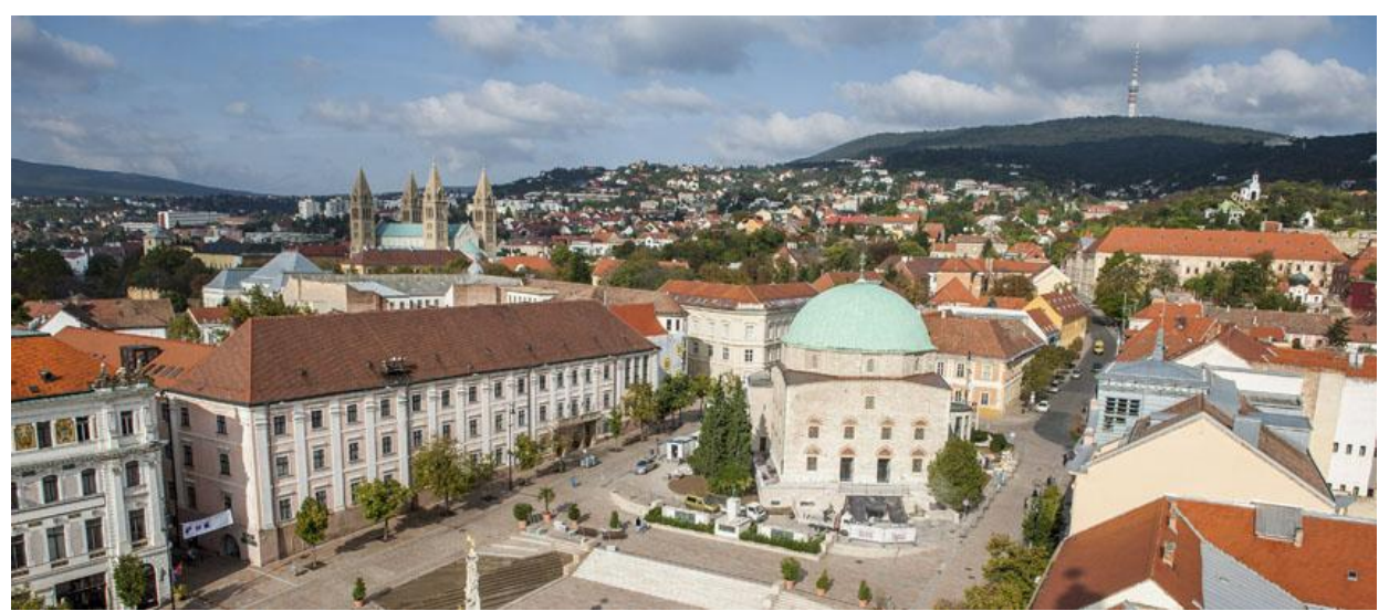
Fig. 1: View of Pecs from the background of the Mecsek Mountains.

Pécs is located in the Carpathian Basin, in the southern Hungarian county of Baranya, near to the border of Croatia. Its southern part is rather plain whereas its northern part belongs to the slope of the Mecsek Mountain (400-600 meters high). Pécs has a significant mining past. It has a very favourable climate, being located on the border of a still flourishing woody area. During the hot summer nights a cooling air streams down from Mecsek to clean the air of the city. Mecsek dolomitic water is famous for its high density of minerals at constant poise. Woody areas generally start from about 300 m height. Mecsek is divided by several valleys which play a key role in ameliorating the climate of the city without lakes and rivers. Waters coming down from Mecsek are collected by Pécsi water leading them eventually to the Danube.