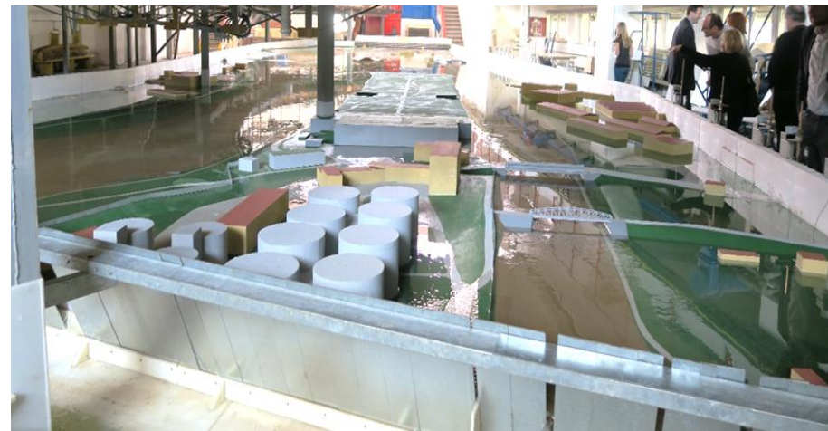
Physical flood model Troja Basin, Prague (CZ)