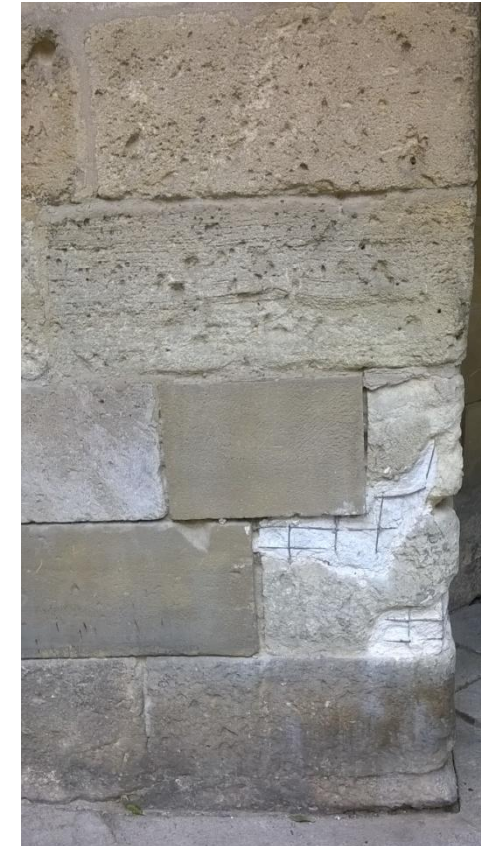
Inappropriate repair, lack of knowledge.