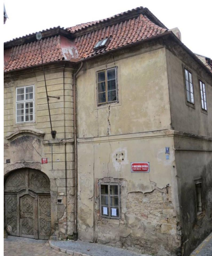
Lack of maintenance, property issues.