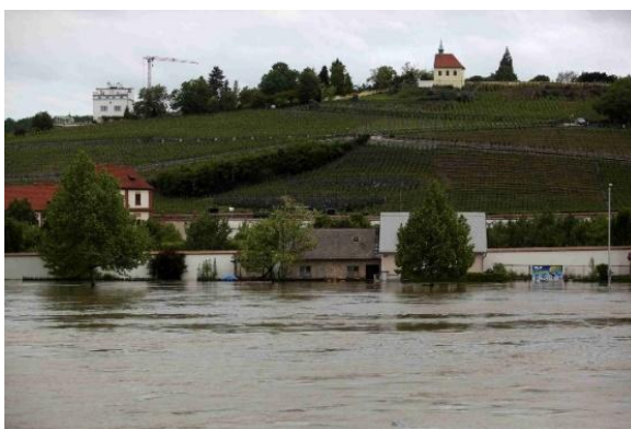
Floods in Troja District in 2002, on the front left early Baroque Chateau Troja

The main objective of the event is to present the latest developments in the Interreg Central Europe project ProteCHt2save to European and local authorities and stakeholders, with special accent on experiences in historic Prague , and to present a perspective and experiences from the point of view of management of cultural heritage protection in the changing environment.