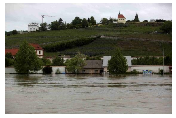
Floods in Troja District in 2002, on the front left early Baroque Chateau Troja

The main objective of the event is to present the latest developments in the Interreg Central Europe project ProteCHt2save to European and local authorities and stakeholders, with special accent on experiences in historic Prague , and to present a perspective and experiences from the point of view of management of cultural heritage protection in the changing environment.